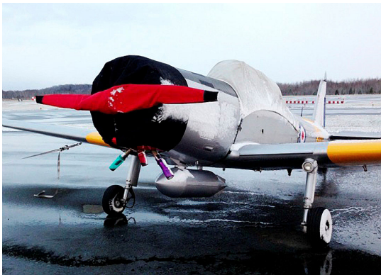
De Havilland DH1 Chipmunk Canopy Cover (English Canopy), & Prop Cover

This cover type is made from Silver Acrylic Sunbrella canvas and is 100% lined with a soft and smooth microfiber. Bruce's Custom Covers developed this material combination especially for aircraft protection. The outer material is medium weight and treated for water resistance, UV resistance and anti-static buildup. The inner lining is a very soft and smooth microfiber to prevent scratching. The material is very reflective, and tests show that the cabin interior temperature can be reduced to near-ambient temperature on the hottest of days. It is water, ice and snow repellent, yet breathable to allow moisture to escape from between the cover and the aircraft surface.