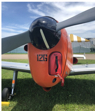
De Havilland Chipmunk Engine Plug