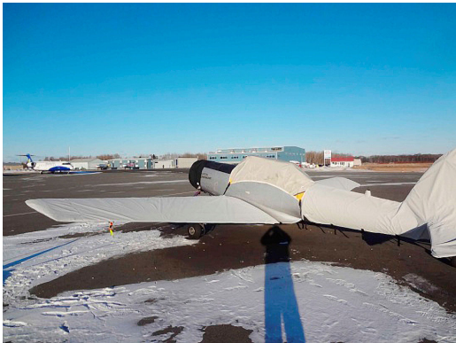
De Havilland DH1 Chipmunk Engine, Wings, Canopy and Empennage Covers

WINTER USE MATERIAL - Made with Solution-Dyed Polyester fabric, this option is intended for seasonal use to aid in deicing, rain mitigation, or for occasional travel. The material is lighter and more compact, but more susceptible to UV damage and may have a shorter useful life if used continuously outside than the all-year use material.