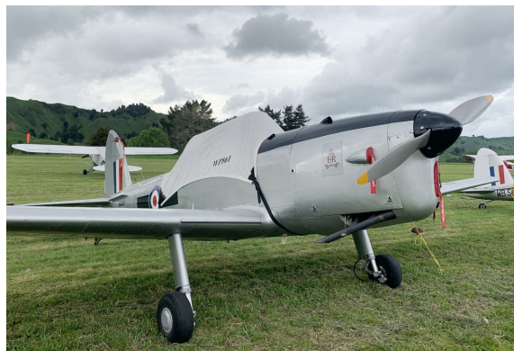
DeHavilland Chipmunk Canopy Cover, Engine Plugs