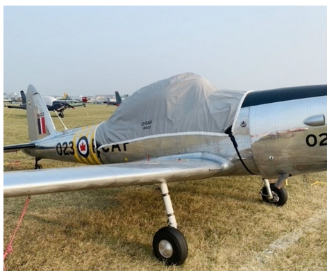
DeHavilland Chipmunk Travel Weight Canopy Cover