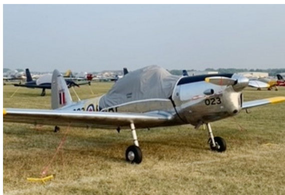
DeHavilland Chipmunk Travel Weight Canopy Cover