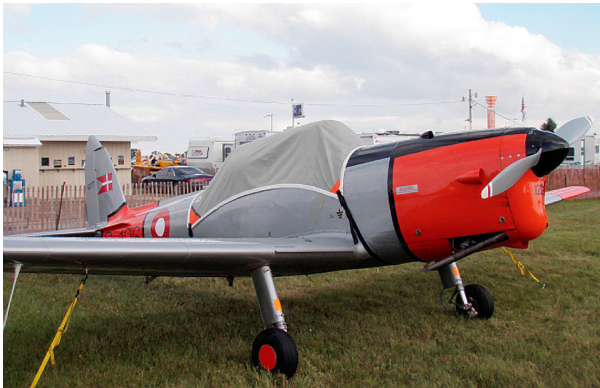
De Havilland DH1 Chipmunk Canopy Cover (English Canopy)