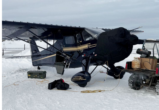
Howard DGA Insulated Engine Cover

This cover type is made from Silver Acrylic Sunbrella canvas and is 100% lined with a soft and smooth microfiber. Bruce's Custom Covers developed this material combination especially for aircraft protection. The outer material is medium weight and treated for water resistance, UV resistance and anti-static buildup. The inner lining is a very soft and smooth microfiber to prevent scratching. The material is very reflective, and tests show that the cabin interior temperature can be reduced to near-ambient temperature on the hottest of days. It is water, ice and snow repellent, yet breathable to allow moisture to escape from between the cover and the aircraft surface.