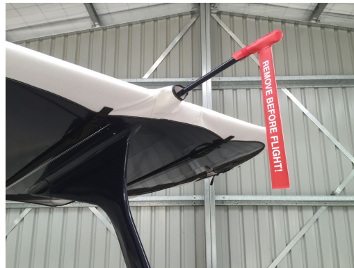
Beech Staggerwing Complete Cover Set, Upper Wing Detail

Howard DGA Models Pitot Tube Covers , NOT HEAT RESISTANT TYPE, are made of Naugahyde vinyl, and are designed to cover the entire pitot assembly. Slipping over the tube, the cover tightens around the base with a Velcro strap detail. A "Remove Before Flight" streamer is attached to the cover. Heat Resistant Pitot Covers are an upgrade to this design, and help prevent the pitot cover from melting onto the tube if the pitot heat is accidentally turned on while installed. If you want the set tethered together, please let us know.