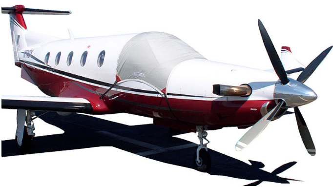
PC-12 Canopy Cover, Engine Plugs, Prop Tie/Exhaust Covers