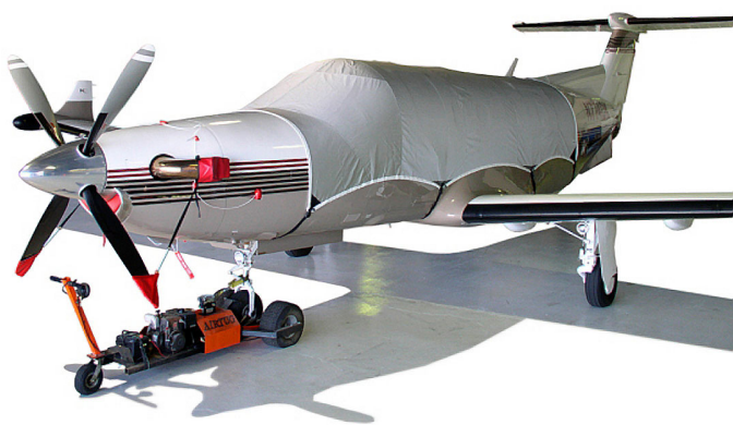
PC-12 Canopy Cover, Engine Plugs, Prop Tie/Exhaust Covers