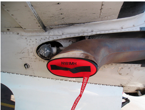
Beech 18 Exhaust Plugs

Engine Inlet Plugs are custom fit for your Douglas DC-3 intakes, made with heavy-duty vinyl material, and stuffed with a single block of sculpted urethane foam. Each plug has a zipper that allows the foam to be removed and dried if necessary. Engine plugs have warning flags that are visible from the cockpit or 'remove before flight' streamers sewn onto the face of the plugs. Most plugs are imprinted with the aircraft registration number in black for an extra charge. Storage bag NOT included. Engine plugs may be inserted after flight when the engine is still warm. Engine Inlet Plugs are commonly referred to as Cowl Plugs, Intake Plugs, Cowl Blocks, Engine Blocks, and Engine Bungs.