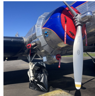
DC-3 Engine Plugs, Tire Covers