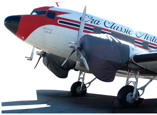
Engine Covers are available in either standard or insulated designs.