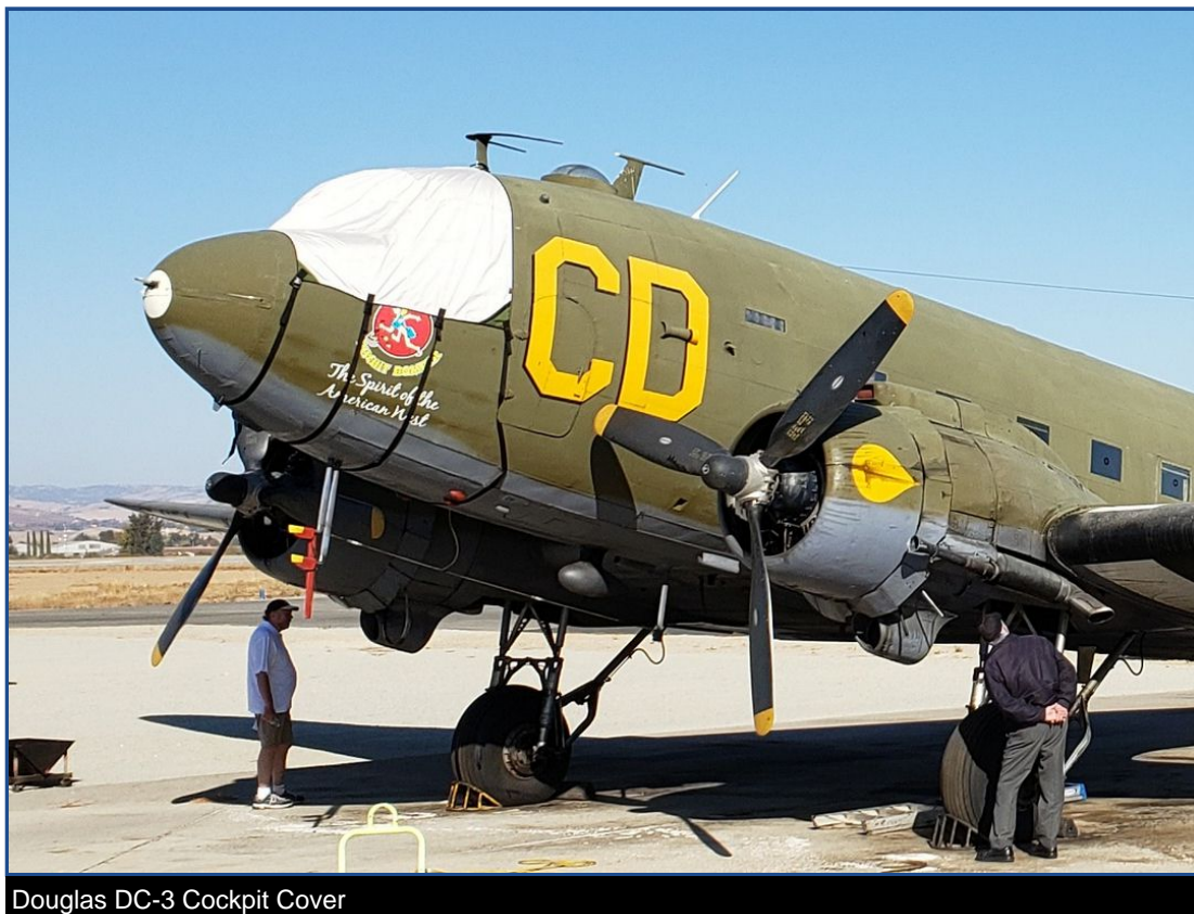
Douglas DC-3 Cockpit Cover