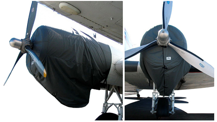
DC3 Engine Covers are custom made for various engine mod's.