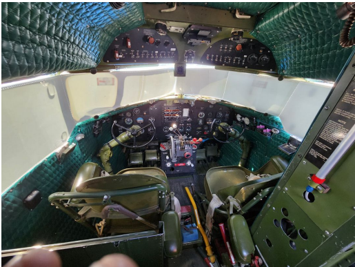
DC-3C Cockpit Heatshields