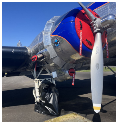
DC-3 Engine Plugs, Tire Covers