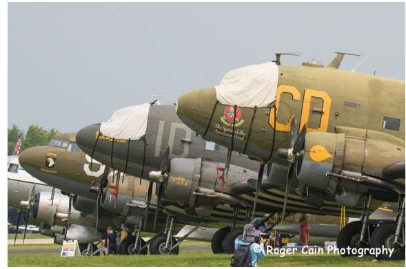
Douglas DC-3's with Cockpit Covers