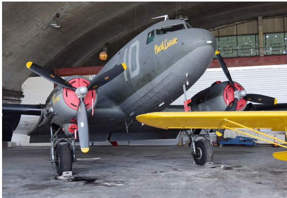
Douglas DC-3 Engine & Oil Cooler Plugs