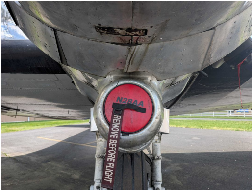
Douglas DC-3 Engine Plugs

Engine Inlet Plugs are custom fit for your Douglas DC-3 intakes, made with heavy-duty vinyl material, and stuffed with a single block of sculpted urethane foam. Each plug has a zipper that allows the foam to be removed and dried if necessary. Engine plugs have warning flags that are visible from the cockpit or 'remove before flight' streamers sewn onto the face of the plugs. Most plugs are imprinted with the aircraft registration number in black for an extra charge. Storage bag NOT included. Engine plugs may be inserted after flight when the engine is still warm. Engine Inlet Plugs are commonly referred to as Cowl Plugs, Intake Plugs, Cowl Blocks, Engine Blocks, and Engine Bungs.