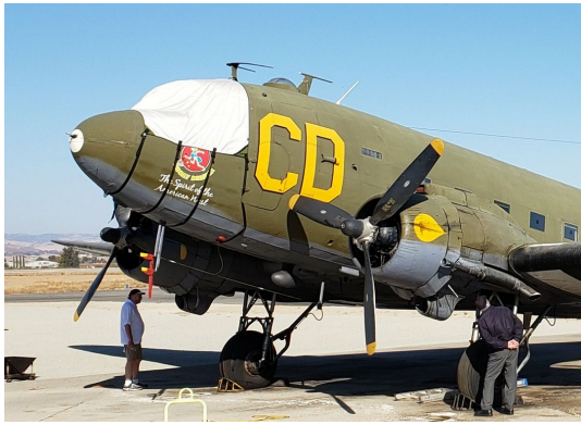
Douglas DC-3 Cockpit Cover