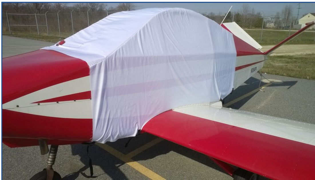
Davis DA-2A Extended Canopy Cover, test fit cover