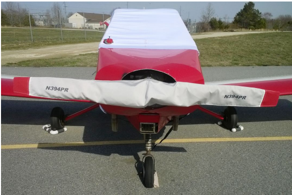
Davis DA-2A Propellor/Spinner Cover

This cover type is made from Silver Acrylic Sunbrella canvas and is 100% lined with a soft and smooth microfiber. Bruce's Custom Covers developed this material combination especially for aircraft protection. The outer material is medium weight and treated for water resistance, UV resistance and anti-static buildup. The inner lining is a very soft and smooth microfiber to prevent scratching. The material is very reflective, and tests show that the cabin interior temperature can be reduced to near-ambient temperature on the hottest of days. It is water, ice and snow repellent, yet breathable to allow moisture to escape from between the cover and the aircraft surface.