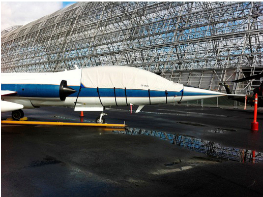
F-104 Tandem Canopy Cover