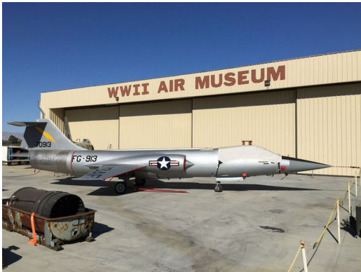
Lockheed F-104 Starfighter Canopy Cover, Single Seat Model