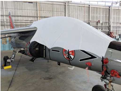
Dornier Alpha Jet Canopy Cover, test fit cover