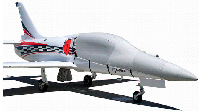
L39 Canopy/Nose Cover & Intake Plugs