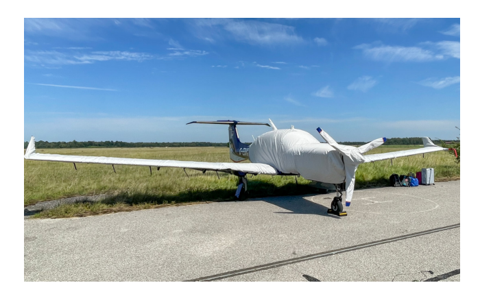
Diamond DA-50 Extended Canopy/Engine, Prop & Wing Covers Diamond DA-50 Extended Canopy/Engine Cover, Wing & Prop (test fit) Covers