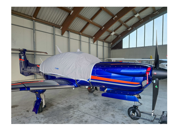
Diamond DA-50 Canopy Cover, Engine Plugs