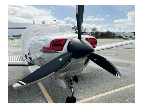
Diamond DA-50 Engine Plugs

Engine Inlet Plugs are custom fit for your Diamond DA-50 Superstar intakes, made with heavy-duty vinyl material, and stuffed with a single block of sculpted urethane foam. Each plug has a zipper that allows the foam to be removed and dried if necessary. Engine plugs have warning flags that are visible from the cockpit or 'remove before flight' streamers sewn onto the face of the plugs. Most plugs are imprinted with the aircraft registration number in black for an extra charge. Storage bag NOT included. Engine plugs may be inserted after flight when the engine is still warm. Engine Inlet Plugs are commonly referred to as Cowl Plugs, Intake Plugs, Cowl Blocks, Engine Blocks, and Engine Bungs.