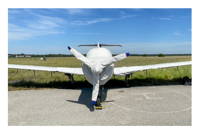
Diamond DA-50 Extended Canopy/Engine, Prop & Wing Covers Diamond DA-50 Extended Canopy/Engine Cover, Wing & Prop (test fit)