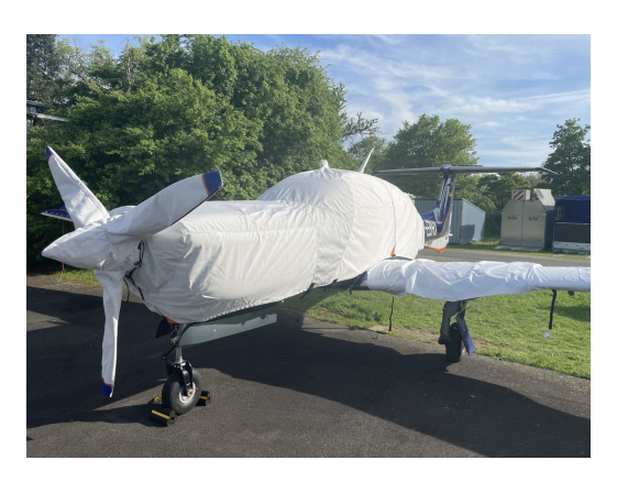
Diamond DA-50 Extended Canopy/Engine, Prop & Wing Covers Diamond DA-50 Extended Canopy/Engine, Prop & Wing Covers (test fit) (test fit)