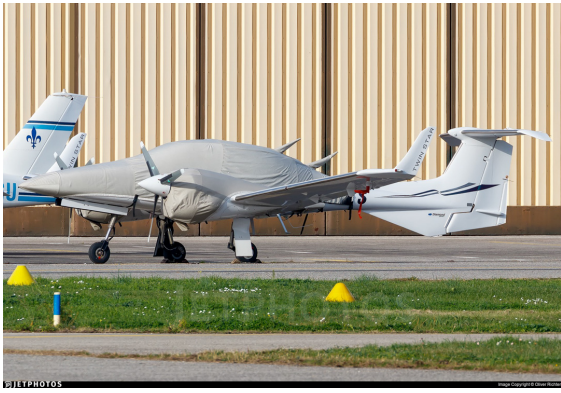
Diamond DA-42 Extended Canopy/Nose Cover, Engine Covers