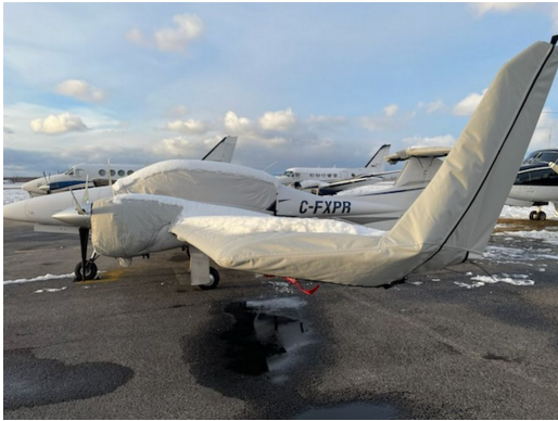
Diamond DA-42 Canopy, Wing, Engine & Horizontal Stabilizer Covers