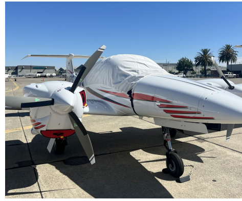
Diamond DA-42 Twin Star Canopy Cover