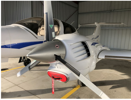
Diamond DA-42 Engine Inlet Plugs