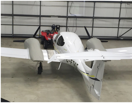
Diamond DA-42 Twinstar Engine Covers