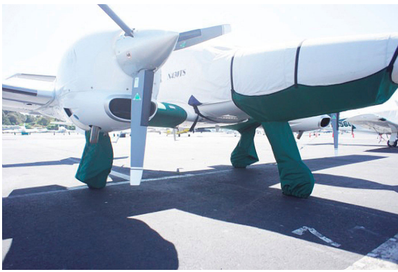
Twinstar Landing Gear & Gearwell Covers