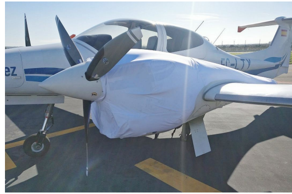
DA42 MPP Guardian (DA42-NG) Engine Cover, test fit cover