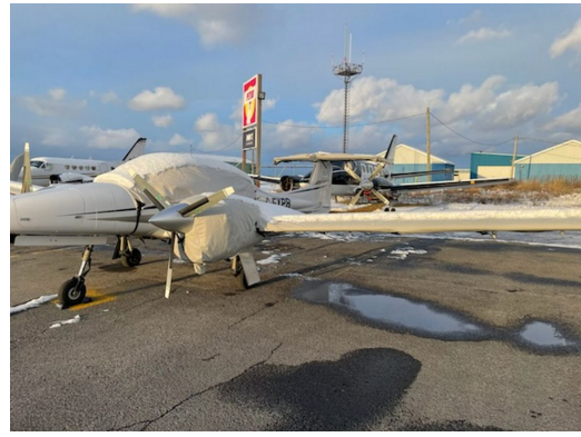
Diamond DA-42 Canopy, Wing, Engine & Horizontal Stabilizer Covers