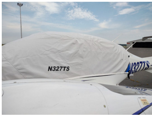
Diamone DA-42 Twin Star Canopy Cover