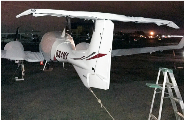
Diamond DA-42 Twin Star Wing & Engine Covers

WINTER USE MATERIAL - Made with Solution-Dyed Polyester fabric, this option is intended for seasonal use to aid in deicing, rain mitigation, or for occasional travel. The material is lighter and more compact, but more susceptible to UV damage and may have a shorter useful life if used continuously outside than the all-year use material.