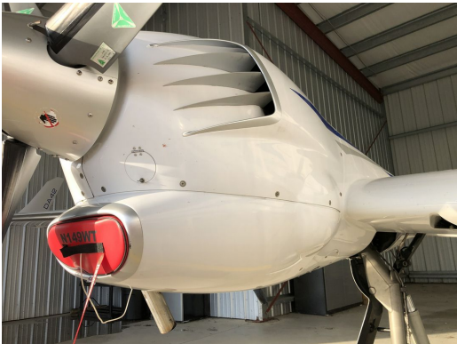
Diamond DA-42 Engine Inlet Plugs