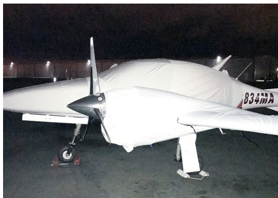
Diamond DA-42 Twin Star Wing & Engine Covers

WINTER USE MATERIAL - Made with Solution-Dyed Polyester fabric, this option is intended for seasonal use to aid in deicing, rain mitigation, or for occasional travel. The material is lighter and more compact, but more susceptible to UV damage and may have a shorter useful life if used continuously outside than the all-year use material.