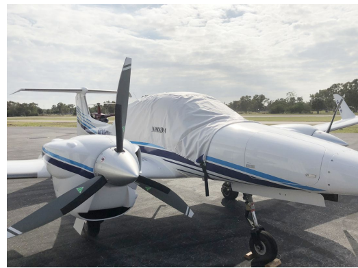
Diamond DA-42 Twin Star Canopy Cover