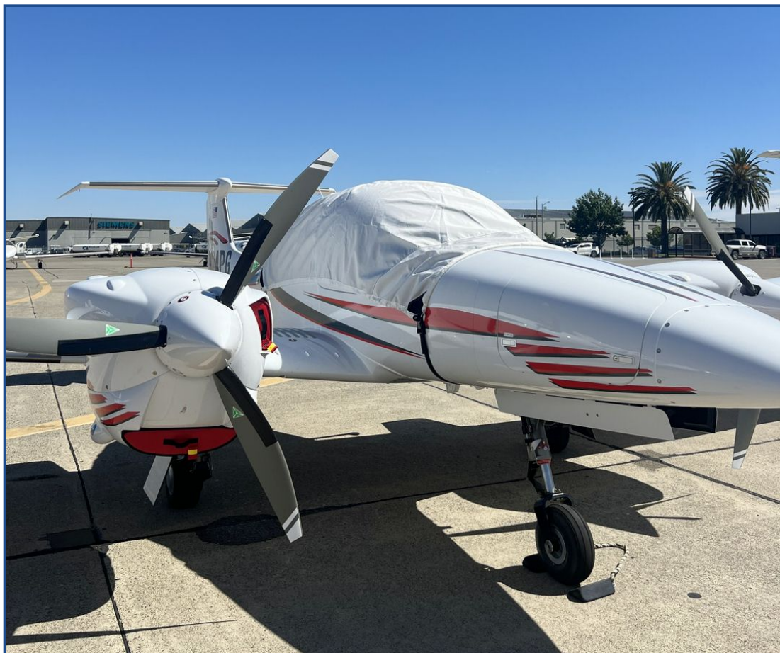
Diamond DA-42 Twin Star Canopy Cover