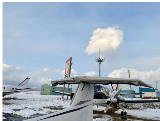
Diamond DA-42 Horizontal Stabilizer Cover