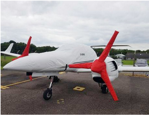
Diamond DA-42 Canopy/Nose and Insulated Prop Covers