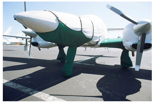
Diamond DA-42 Twinstar Landing Gear & Gearwell Covers