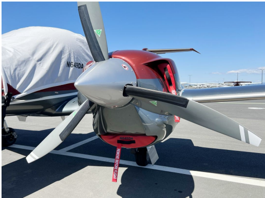
Diamond DA-42 Engine Inlet Plugs

Engine Inlet Plugs are custom fit for your Diamond DA-42 Twin Star intakes, made with heavy-duty vinyl material, and stuffed with a single block of sculpted urethane foam. Each plug has a zipper that allows the foam to be removed and dried if necessary. Engine plugs have warning flags that are visible from the cockpit or 'remove before flight' streamers sewn onto the face of the plugs. Most plugs are imprinted with the aircraft registration number in black for an extra charge. Storage bag NOT included. Engine plugs may be inserted after flight when the engine is still warm. Engine Inlet Plugs are commonly referred to as Cowl Plugs, Intake Plugs, Cowl Blocks, Engine Blocks, and Engine Bungs.