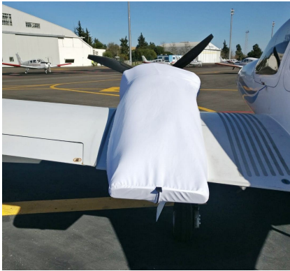
DA42 MPP Guardian (DA42-NG) Engine Cover, test fit cover

The material is very reflective, and tests show that the cabin interior temperature can be reduced to near-ambient temperature on the hottest of days. It is water, ice and snow repellent, yet breathable to allow moisture to escape from between the cover and the aircraft surface.