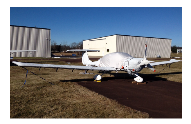
Diamond DA-40 Full Cover Set, with Insulated Engine Cover

WINTER USE MATERIAL - Made with Solution-Dyed Polyester fabric, this option is intended for seasonal use to aid in deicing, rain mitigation, or for occasional travel. The material is lighter and more compact, but more susceptible to UV damage and may have a shorter useful life if used continuously outside than the all-year use material.