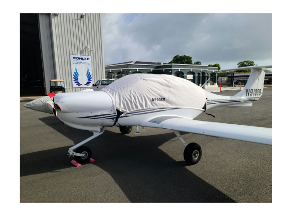
Diamond DA-40 Canopy & Prop Covers