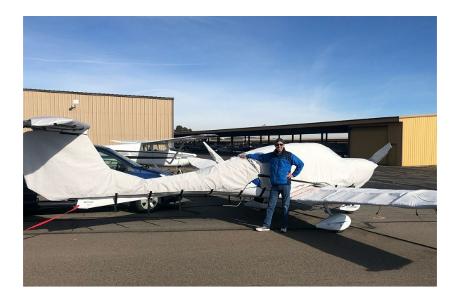
Diamond DA40 Canopy, Insulated Engine, Wing and Stab. Covers Diamond DA-40 Wing Covers All Year Use with Hail Protection