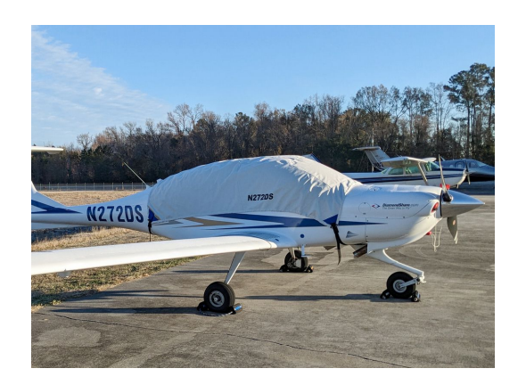
Diamond DA-40 Canopy Cover

This cover type is made from Silver Acrylic Sunbrella canvas and is 100% lined with a soft and smooth microfiber. Bruce's Custom Covers developed this material combination especially for aircraft protection. The outer material is medium weight and treated for water resistance, UV resistance and anti-static buildup. The inner lining is a very soft and smooth microfiber to prevent scratching. The material is very reflective, and tests show that the cabin interior temperature can be reduced to near-ambient temperature on the hottest of days. It is water, ice and snow repellent, yet breathable to allow moisture to escape from between the cover and the aircraft surface.