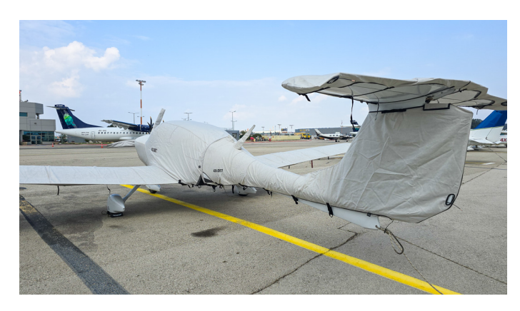
Diamond DA-40 Empennage Cover (Tailboom, Vertical & Horiz Stabilizers) Set (W/Horiz. Stab. Cover), 2004 & Up: Larger Rudder, All Year Use