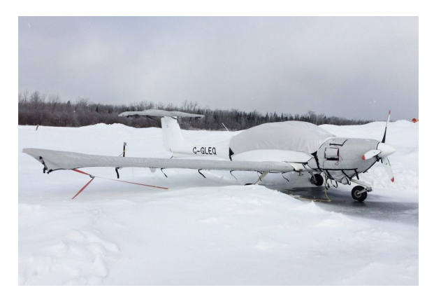
Diamond DA40 Canopy, Insulated Engine, Wing and Stab. Covers