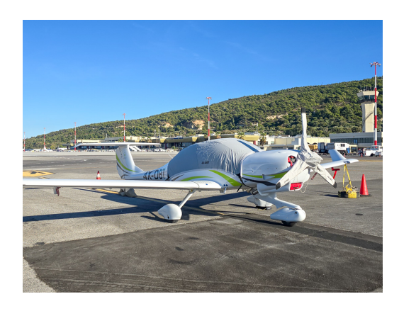
Diamond DA-40 Canopy & Prop Covers, Engine Plugs