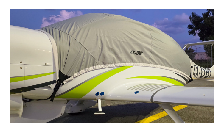
Diamond DA-40 Travel Cover, Light Weight Canopy Cover, Ng Model (Aft Scoop Ext.)