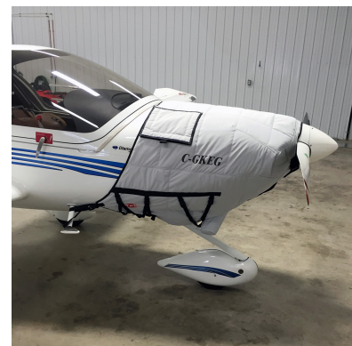
Diamond DA-20-C1 Insulated Engine Cover