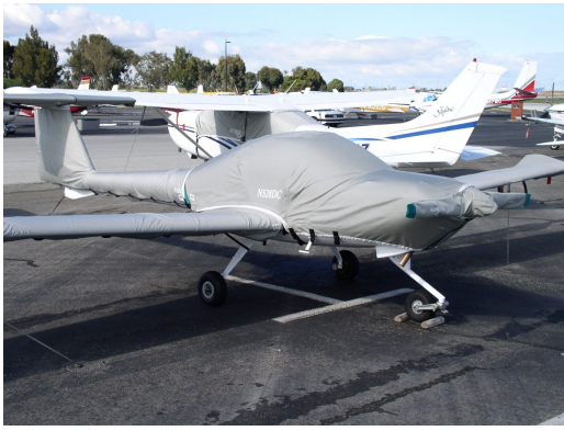
DA-20 Full Cover Set