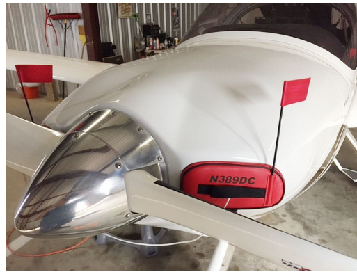
Diamond DA-20-C1 Engine Inlet Plugs