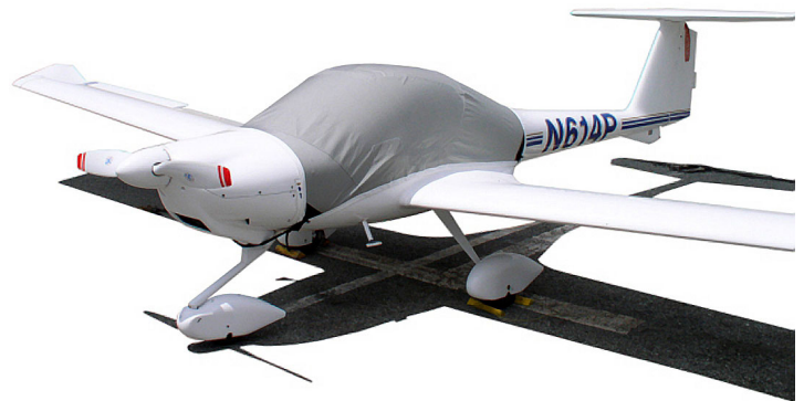
Diamond DA-20 Canopy Cover