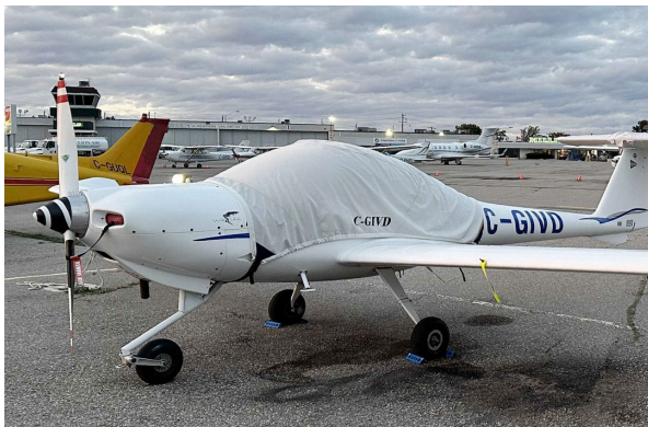
Diamond DA-20 Canopy Cover

This cover type is made from Silver Acrylic Sunbrella canvas and is 100% lined with a soft and smooth microfiber. Bruce's Custom Covers developed this material combination especially for aircraft protection. The outer material is medium weight and treated for water resistance, UV resistance and anti-static buildup. The inner lining is a very soft and smooth microfiber to prevent scratching. The material is very reflective, and tests show that the cabin interior temperature can be reduced to near-ambient temperature on the hottest of days. It is water, ice and snow repellent, yet breathable to allow moisture to escape from between the cover and the aircraft surface.