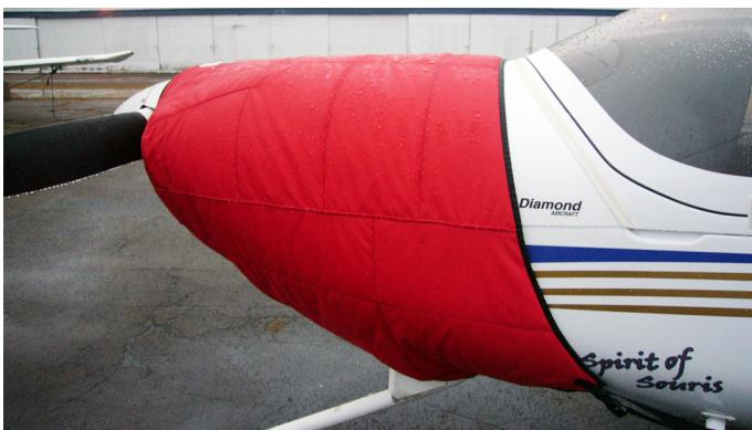
Diamond DA-20-C1 Insulated Engine Cover

This cover type is made from Silver Acrylic Sunbrella canvas and is 100% lined with a soft and smooth microfiber. Bruce's Custom Covers developed this material combination especially for aircraft protection. The outer material is medium weight and treated for water resistance, UV resistance and anti-static buildup. The inner lining is a very soft and smooth microfiber to prevent scratching. The material is very reflective, and tests show that the cabin interior temperature can be reduced to near-ambient temperature on the hottest of days. It is water, ice and snow repellent, yet breathable to allow moisture to escape from between the cover and the aircraft surface.