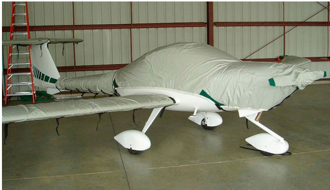
DA-20 Canopy/Engine, Prop/Spinner, Wing, Tailboom, Horiz. Stab. Covers

This cover type is made from Silver Acrylic Sunbrella canvas and is 100% lined with a soft and smooth microfiber. Bruce's Custom Covers developed this material combination especially for aircraft protection. The outer material is medium weight and treated for water resistance, UV resistance and anti-static buildup. The inner lining is a very soft and smooth microfiber to prevent scratching. The material is very reflective, and tests show that the cabin interior temperature can be reduced to near-ambient temperature on the hottest of days. It is water, ice and snow repellent, yet breathable to allow moisture to escape from between the cover and the aircraft surface.