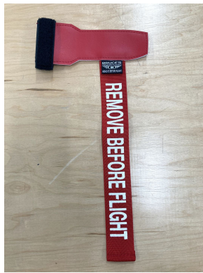
Pitot Tube Cover

Engine Inlet Plugs are custom fit for your Diamond DA-20, Katana, Eclipse intakes, made with heavy-duty vinyl material, and stuffed with a single block of sculpted urethane foam. Each plug has a zipper that allows the foam to be removed and dried if necessary. Engine plugs have warning flags that are visible from the cockpit or 'remove before flight' streamers sewn onto the face of the plugs. Most plugs are imprinted with the aircraft registration number in black for an extra charge. Storage bag NOT included. Engine plugs may be inserted after flight when the engine is still warm. Engine Inlet Plugs are commonly referred to as Cowl Plugs, Intake Plugs, Cowl Blocks, Engine Blocks, and Engine Bungs.