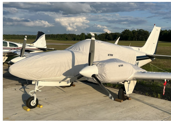
Beech C55 Baron Extended Canopy/Nose Cover, Engine Covers