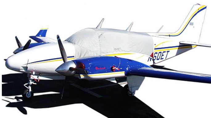
Standard Canopy Cover & Engine Plugs