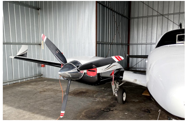
Baron 58 Engine Plugs