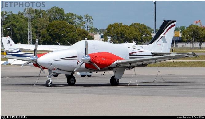
Beech Baron 58, G58 Canopy Cover, Insulated Engine Covers