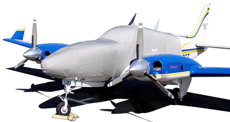
Baron Canopy/Nose Cover