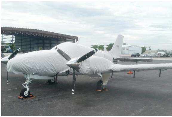
Full Cover Set (58P-020, 58P-225, 58P-405)