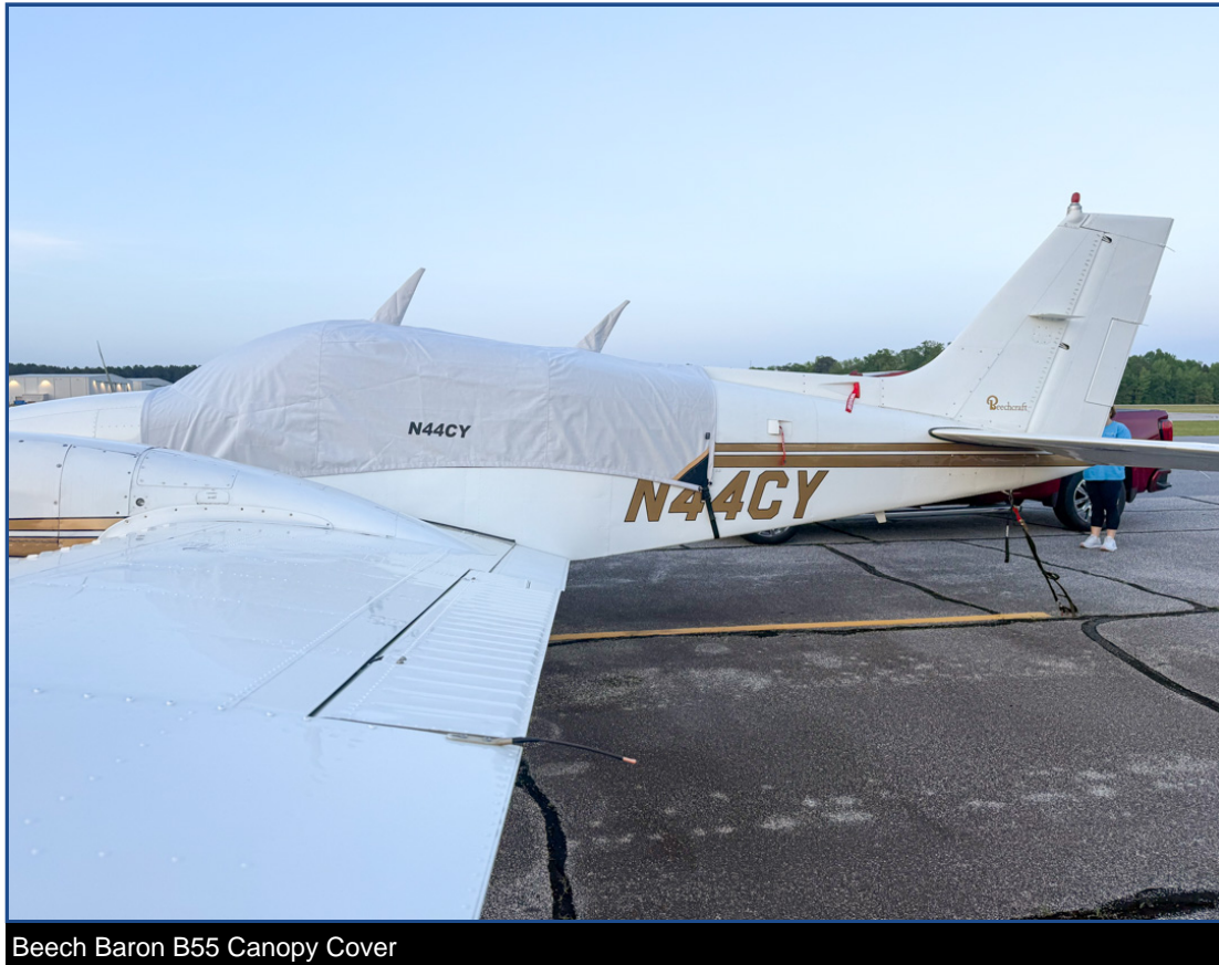
Beech Baron B55 Canopy Cover