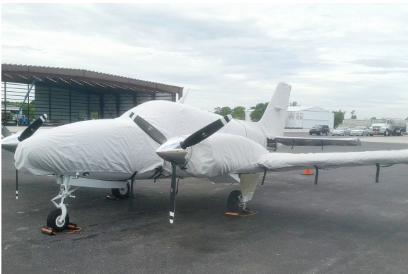
Full Cover Set (58P-020, 58P-225, 58P-405)

WINTER USE MATERIAL - Made with Solution-Dyed Polyester fabric, this option is intended for seasonal use to aid in deicing, rain mitigation, or for occasional travel. The material is lighter and more compact, but more susceptible to UV damage and may have a shorter useful life if used continuously outside than the all-year use material.