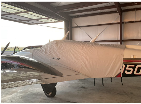
Beech Baron 58TC Extended Canopy Cover