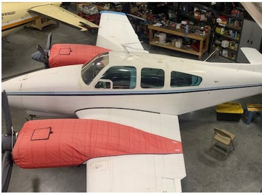
Beech Baron B55 Insulated Engine Covers

The material is very reflective, and tests show that the cabin interior temperature can be reduced to near-ambient temperature on the hottest of days. It is water, ice and snow repellent, yet breathable to allow moisture to escape from between the cover and the aircraft surface.