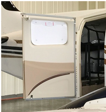
Beech Baron 58 Cabin HeatShield

Windshield Heatshields are interior sunshades for an aircraft's front windshield. The product is a unique composite of closed-cell foam with a silver mylar finish. The semi-rigid design is stiff enough to stand along the inside of the windshield using sun visors or window framing. It folds up flat and easily stores in the included storage sleeve. Some designs may require velcro and suction cups or split right and left sides. A Heatshield is an excellent short-term remedy for cockpit overheating. An external fabric cover is far more effective and practical for long-term protection.