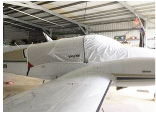
Beech Baron B-55 Canopy Cover