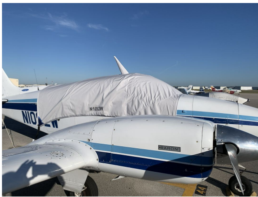
Beech Baron Canopy Cover