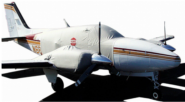
Standard Canopy Cover & Engine Plugs. Extended Canopy Cover & Engine Cover

The material is very reflective, and tests show that the cabin interior temperature can be reduced to near-ambient temperature on the hottest of days. It is water, ice and snow repellent, yet breathable to allow moisture to escape from between the cover and the aircraft surface.