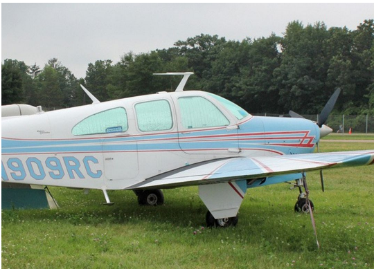
Beech Bonanza/Debonair HeatShield Set