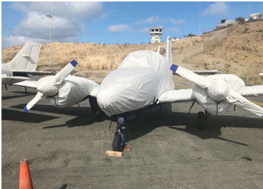
Beech Travel Air Full Cover Set