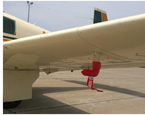
Mooney Pitot Cover