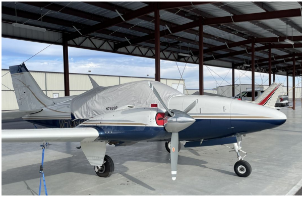
Beech Baron D55 Canopy Cover, Engine Plugs