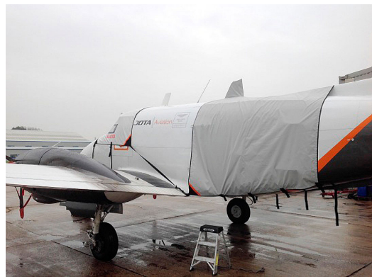
King Air Cargo/Jump Door Rain Cover