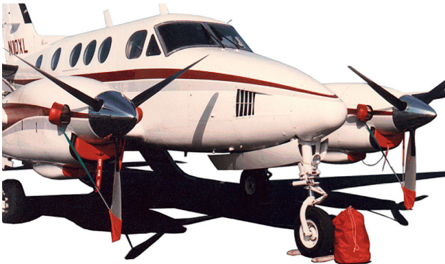
Pitot, Exhaust Covers, Engine Plugs & Prop Ties