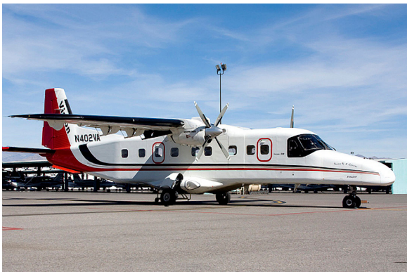
Covers, Plugs & HeatShields for the Dornier 228