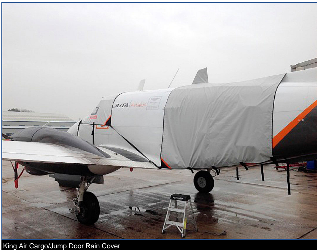
King Air Cargo/Jump Door Rain Cover