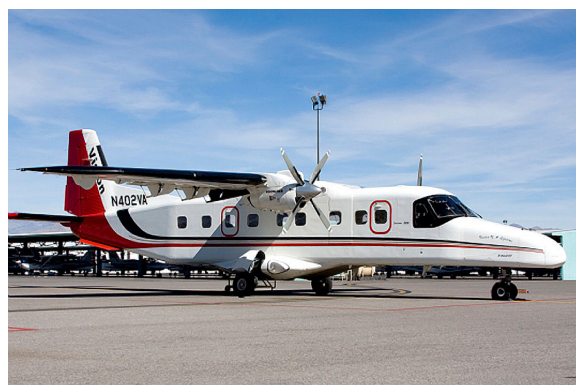
Covers, Plugs & HeatShields for the Dornier 228