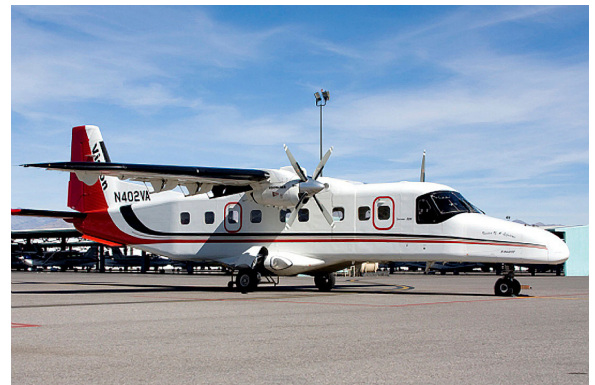
Covers, Plugs & HeatShields for the Dornier 228