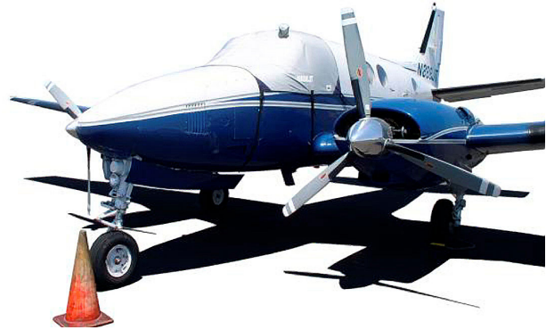
King Air Cockpit Cover, belly-strap type