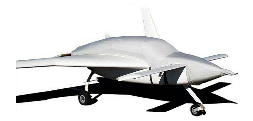
Velocity Canopy/Nose/Engine Cover