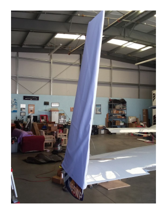
Velocity Vertical Stabilizer Covers, test fit cover