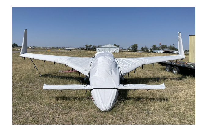
Cozy Mk IV Complete Cover Set

WINTER USE MATERIAL - Made with Solution-Dyed Polyester fabric, this option is intended for seasonal use to aid in deicing, rain mitigation, or for occasional travel. The material is lighter and more compact, but more susceptible to UV damage and may have a shorter useful life if used continuously outside than the all-year use material.