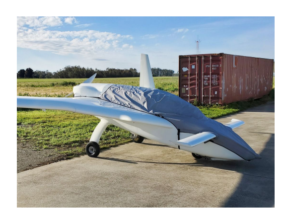
Cozy Travel Weight Canopy/Nose Cover

Travel Covers are made with Silver Solution-Dyed Polyester fabric and only lined over the windshield to save weight. The material is lightweight and more compact for easy stowage in the aircraft. The polyester material is water resistant, but only intended for occasional use outside. We also have an ultra lightweight material available for fitted hangar dust covers. For daily outdoor use, the non-travel Sunbrella Cover is the best choice.