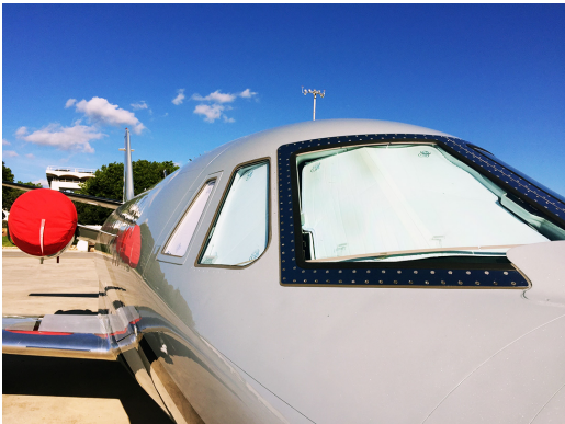
Cessna Citation XL, XLS (560XL) Cockpit Heatshields

Cockpit Heatshields are interior sunshades for the aircraft's cockpit. The product is a unique composite of closed-cell foam with a silver mylar finish. The semi-rigid design is stiff enough to stand inside the window framing. The set folds up flat and is easily stored in the included storage sleeve. Some designs may require velcro and suction cups. Our Heatshields for jets are offered white side out because some aircraft manufacturers have issued advisories against reflective window inserts due to potential heat damage. A Heatshield is an excellent short-term remedy for cockpit overheating, but an external fabric cover is more effective for long-term protection.