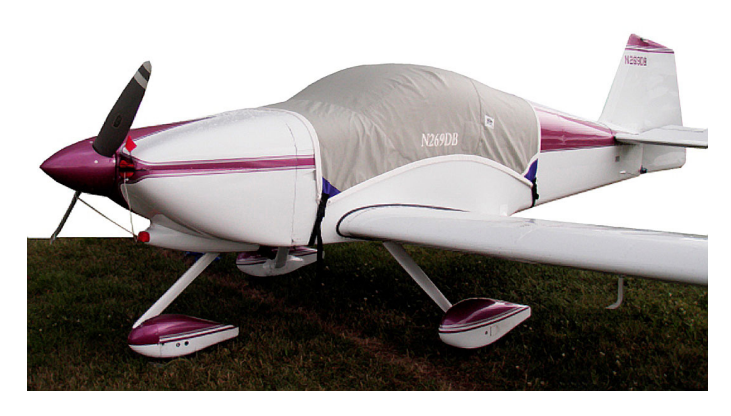
Van's RV-6 Canopy Cover