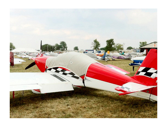
Van's RV-6 Canopy Cover