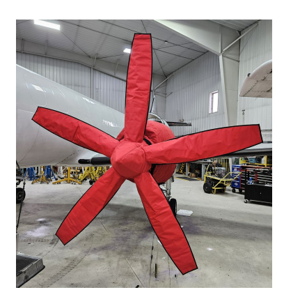
Fairchild Metro 5 Blade Insulated Insulated Prop Covers

the hottest of days. It is water, ice and snow repellent, yet breathable to allow moisture to escape from between the cover and the aircraft surface.