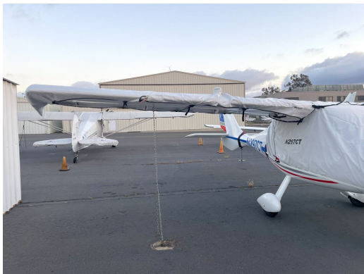
Flight Design CTSW Wing Covers