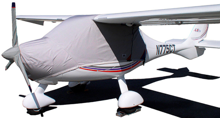
Flight Design CT Canopy/Engine Cover