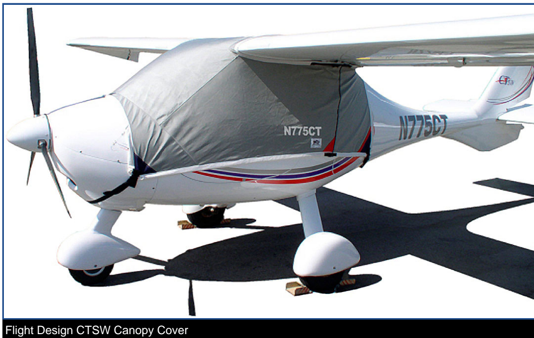
Flight Design CTSW Canopy Cover