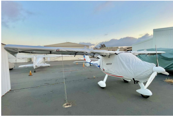
Flight Design CTSW Extended Canopy/Engine & Wing Covers

This cover type is made from Silver Acrylic Sunbrella canvas and is 100% lined with a soft and smooth microfiber. Bruce's Custom Covers developed this material combination especially for aircraft protection. The outer material is medium weight and treated for water resistance, UV resistance and anti-static buildup. The inner lining is a very soft and smooth microfiber to prevent scratching. The material is very reflective, and tests show that the cabin interior temperature can be reduced to near-ambient temperature on the hottest of days. It is water, ice and snow repellent, yet breathable to allow moisture to escape from between the cover and the aircraft surface.