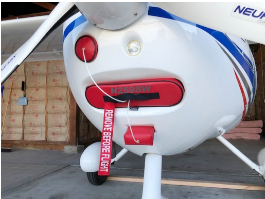
Flight Design CTSW, CTLS, 2K & MC Engine Inlet Plugs