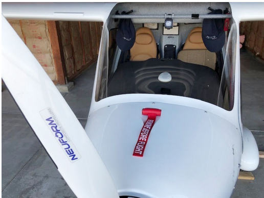
Flight Design CTSW, CTLS, 2K & MC Engine Inlet Plugs

Engine Inlet Plugs are custom fit for your Flight Design CTSW, CTLS, 2K, MC & F2 intakes, made with heavy-duty vinyl material, and stuffed with a single block of sculpted urethane foam. Each plug has a zipper that allows the foam to be removed and dried if necessary. Engine plugs have warning flags that are visible from the cockpit or 'remove before flight' streamers sewn onto the face of the plugs. Most plugs are imprinted with the aircraft registration number in black for an extra charge. Storage bag NOT included. Engine plugs may be inserted after flight when the engine is still warm. Engine Inlet Plugs are commonly referred to as Cowl Plugs, Intake Plugs, Cowl Blocks, Engine Blocks, and Engine Bungs.