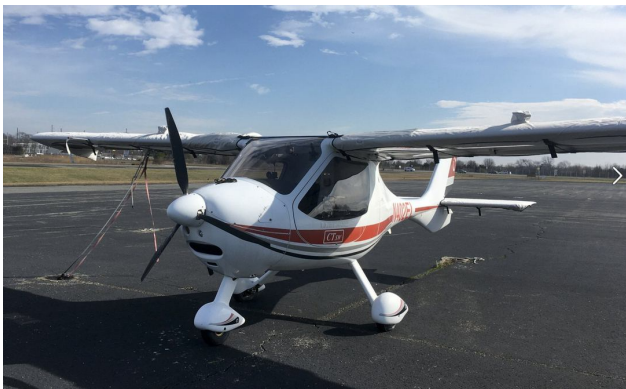
Flight Design CTSW Wing Covers

WINTER USE MATERIAL - Made with Solution-Dyed Polyester fabric, this option is intended for seasonal use to aid in deicing, rain mitigation, or for occasional travel. The material is lighter and more compact, but more susceptible to UV damage and may have a shorter useful life if used continuously outside than the all-year use material.