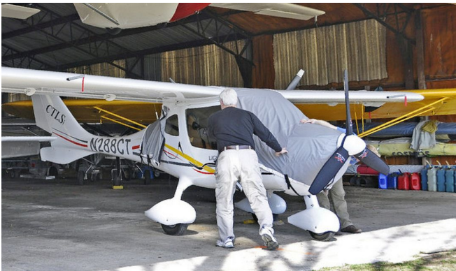
2015 Flight Design CTSW Travel Canopy/Engine Cover