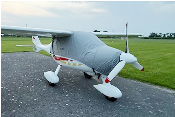
Flight Design CTSW Canopy/Engine Cover, Travel Weight Design

Travel Covers are made with Silver Solution-Dyed Polyester fabric and only lined over the windshield to save weight. The material is lightweight and more compact for easy stowage in the aircraft. The polyester material is water resistant, but only intended for occasional use outside. We also have an ultra lightweight material available for fitted hangar dust covers. For daily outdoor use, the non-travel Sunbrella Cover is the best choice.