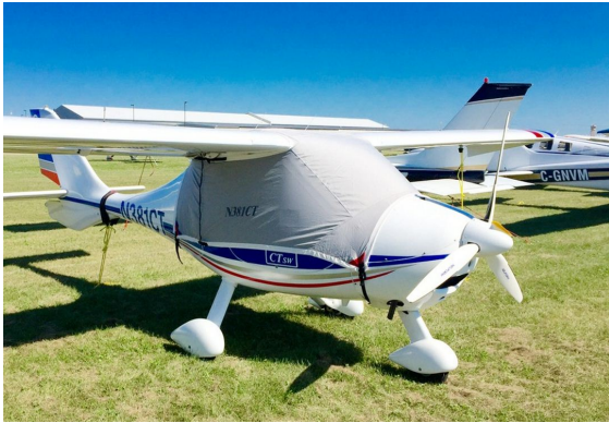
Flight Design CT Canopy Cover