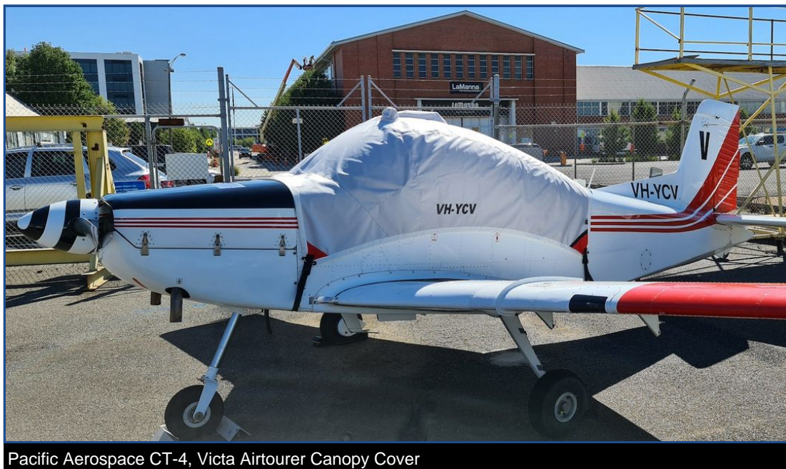
Pacific Aerospace CT-4, Victa Airtourer Canopy Cover