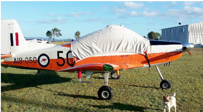
Pacific Aerospace CT-4 Canopy Cover

This cover type is made from Silver Acrylic Sunbrella canvas and is 100% lined with a soft and smooth microfiber. Bruce's Custom Covers developed this material combination especially for aircraft protection. The outer material is medium weight and treated for water resistance, UV resistance and anti-static buildup. The inner lining is a very soft and smooth microfiber to prevent scratching. The material is very reflective, and tests show that the cabin interior temperature can be reduced to near-ambient temperature on the hottest of days. It is water, ice and snow repellent, yet breathable to allow moisture to escape from between the cover and the aircraft surface.