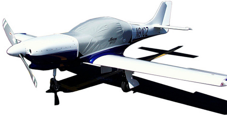
Canopy Cover for Lancair 320/360

The material is very reflective, and tests show that the cabin interior temperature can be reduced to near-ambient temperature on the hottest of days. It is water, ice and snow repellent, yet breathable to allow moisture to escape from between the cover and the aircraft surface.