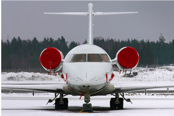
Challenger 604 Intake Covers, OEM design

The Canadair Regional Jet 200, 700 Bikini Style Engine Covers are a single-piece design using a soft and smooth stretchy and fabric. The cover stretches tightly over both the intake and exhaust, installing quickly and easily. These covers are designed to be used as hangar dust covers and have a useful life of approximately one year.