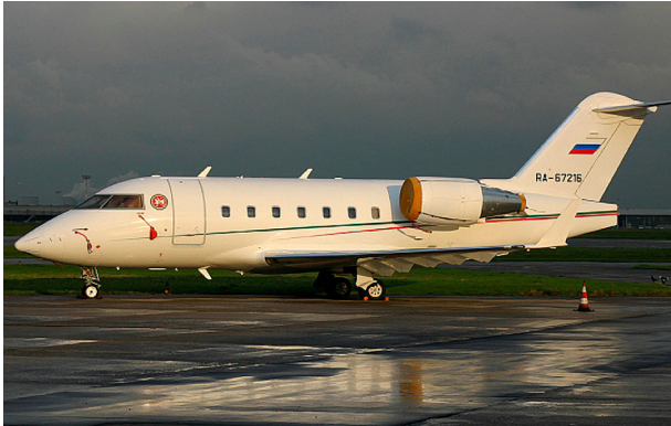
Challenger 604 Intake Covers, OEM design

The Canadair Regional Jet 200, 700 Bikini Style Engine Covers are a single-piece design using a soft and smooth stretchy and fabric. The cover stretches tightly over both the intake and exhaust, installing quickly and easily. These covers are designed to be used as hangar dust covers and have a useful life of approximately one year.