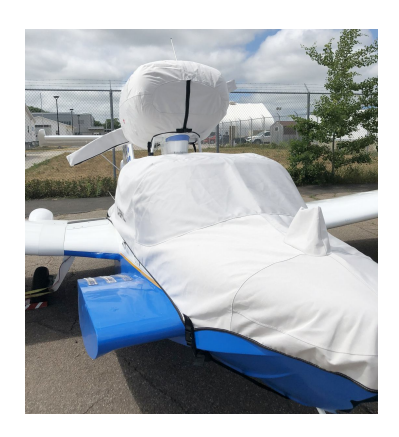
Coot Canopy/Nose, Engine & Prop Covers