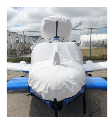
Coot Canopy/Nose, Engine & Prop Covers