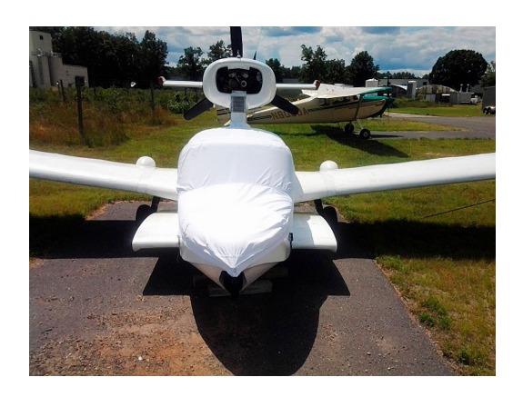
Taylor Coot Canopy/Nose Cover, test fit cover