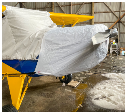
Fleet 80 Canuck Engine Cover, test fit cover