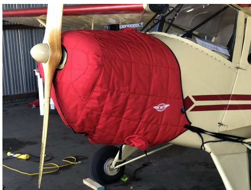
Taylorcraft Insulated Engine Cover

This cover type is made from Silver Acrylic Sunbrella canvas and is 100% lined with a soft and smooth microfiber. Bruce's Custom Covers developed this material combination especially for aircraft protection. The outer material is medium weight and treated for water resistance, UV resistance and anti-static buildup. The inner lining is a very soft and smooth microfiber to prevent scratching. The material is very reflective, and tests show that the cabin interior temperature can be reduced to near-ambient temperature on the hottest of days. It is water, ice and snow repellent, yet breathable to allow moisture to escape from between the cover and the aircraft surface.