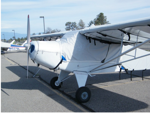
Taylorcraft Over-Top Canopy Cover & Wing Covers

WINTER USE MATERIAL - Made with Solution-Dyed Polyester fabric, this option is intended for seasonal use to aid in deicing, rain mitigation, or for occasional travel. The material is lighter and more compact, but more susceptible to UV damage and may have a shorter useful life if used continuously outside than the all-year use material.