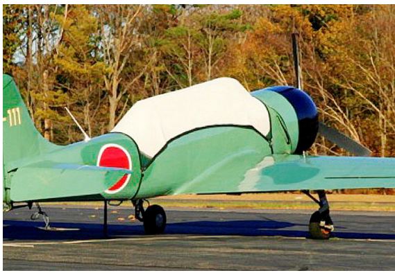
Yak 52 Canopy Cover