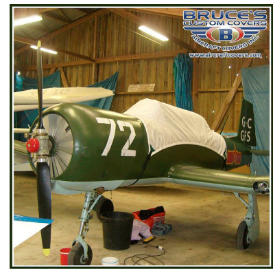
CJ6 Canopy Cover