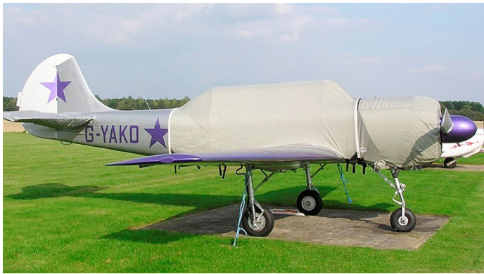
Yak 52 Extended Canopy, Engine & Horiz. Stab. Covers