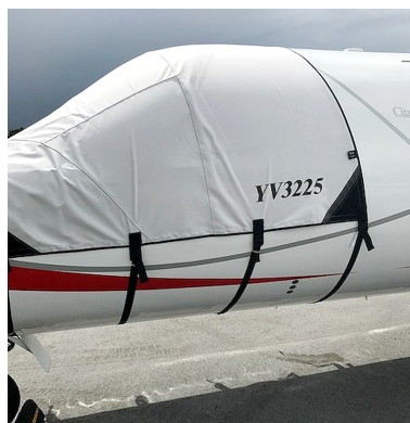
Cessna Citationjet V Ultra (560) Cockpit Cover

This cover type is made from Silver Acrylic Sunbrella canvas and is 100% lined with a soft and smooth microfiber. Bruce's Custom Covers developed this material combination especially for aircraft protection. The outer material is medium weight and treated for water resistance, UV resistance and anti-static buildup. The inner lining is a very soft and smooth microfiber to prevent scratching. The material is very reflective, and tests show that the cabin interior temperature can be reduced to near-ambient temperature on the hottest of days. It is water, ice and snow repellent, yet breathable to allow moisture to escape from between the cover and the aircraft surface.