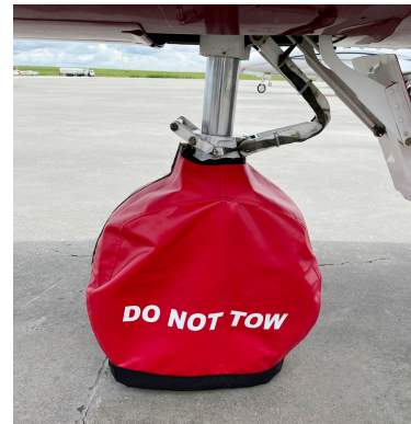
Citationjet CJ-3 Nose Gear Tire Cover