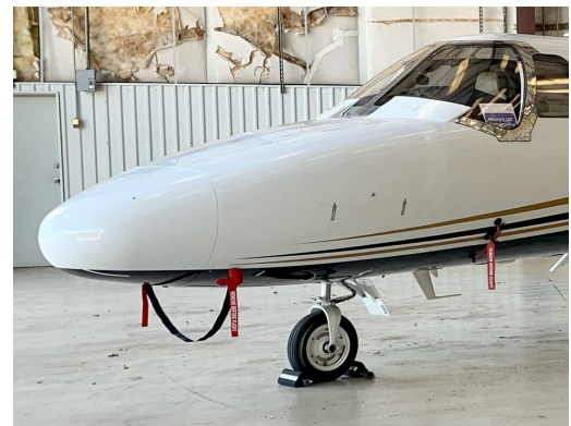
Cessna Citationjet CJ1 Pitot Cover Set