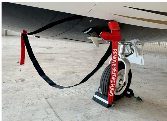
Cessna Citationjet CJ1 Pitot Cover Set

The Engine Inlet Plugs are custom fit for your Cessna Citationjet 525B, CJ-3 intakes, made with heavy-duty vinyl material, and stuffed with a single block of sculpted urethane foam. Each plug has a zipper that allows the foam to be removed and dried if necessary. Engine plugs have 'remove before flight' streamers sewn onto the face of the plugs. Most plugs are imprinted with the aircraft registration number in black for an extra charge. Storage bag NOT included. Engine plugs may be inserted after flight when the engine is still warm. Engine Inlet Plugs are commonly referred to as Cowl Plugs, Intake Plugs, Cowl Blocks, Engine Blocks, and Engine Bungs.