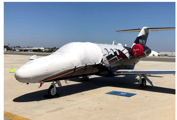
Citationjet CJ1 Cockpit/Nose Cover