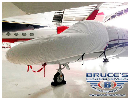
Citation CJ4 Cockpit/Nose Cover and Heat Resistant Pitot Covers set