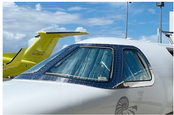
Cessna Citationjet CJ2 Cockpit HeatShields