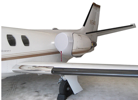
Cessna Citation "Bikini" Type Engine Covers: Extremely Light & Portable

The Cessna Citationjet 525B, CJ-3 Intake/Exhaust Plugs are custom fit for the intake and exhaust openings, made with heavy-duty vinyl material, and stuffed with a single block of sculpted urethane foam. Each plug has a zipper that allows the foam to be removed and dried if necessary. Engine plugs have 'remove before flight' streamers sewn onto the face of the plugs. Most plugs are imprinted with the aircraft registration number in black. Engine plugs may be inserted after flight when the engine is still warm. Engine Inlet Plugs are commonly referred to as Cowl Plugs, Intake Plugs, Cowl Blocks, Engine Blocks, and Engine Bungs.