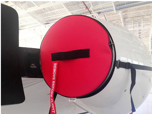
Cessna CJ1 Exhaust Plug