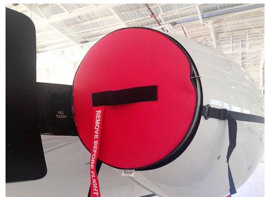
Cessna CJ1 Exhaust Plug