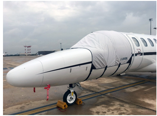
Cessna Citationjet 525A, CJ-2, & CJ2+ Canopy Cover