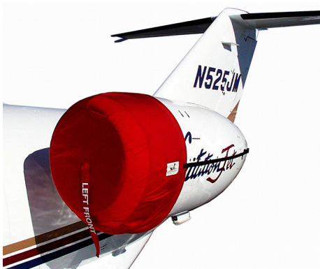
Engine Inlet Cover

The Cessna Citationjet 525A, CJ-2, & CJ2+ Intake/Exhaust Plugs are custom fit for the intake and exhaust openings, made with heavy-duty vinyl material, and stuffed with a single block of sculpted urethane foam. Each plug has a zipper that allows the foam to be removed and dried if necessary. Engine plugs have 'remove before flight' streamers sewn onto the face of the plugs. Most plugs are imprinted with the aircraft registration number in black. Engine plugs may be inserted after flight when the engine is still warm. Engine Inlet Plugs are commonly referred to as Cowl Plugs, Intake Plugs, Cowl Blocks, Engine Blocks, and Engine Bungs.