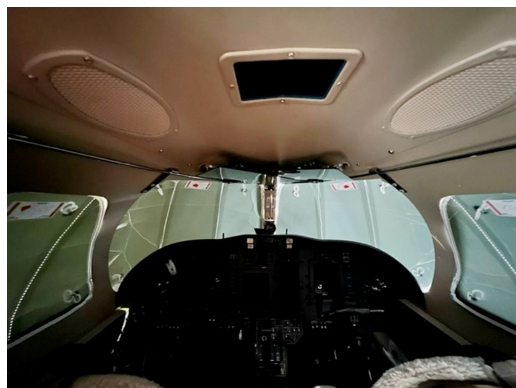
Cessna 525A Cockpit heatshields

Custom-made Heatshield Sunshades are available for almost any window in the jet. Side windows, Skylights, and Emergency Exits are all custom-made. The product is a unique composite of closed-cell foam with a silver mylar finish. The set is easily stored in the included storage sleeve. Some designs may require velcro and suction cups. Our Heatshields are offered white side out since aircraft manufacturers have issued advisories against reflective window inserts due to potential heat damage.