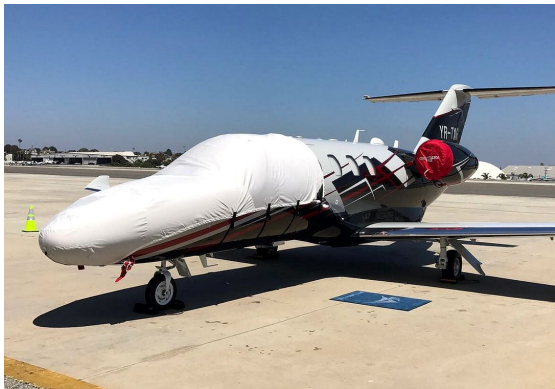
Citationjet CJ1 Cockpit/Nose Cover