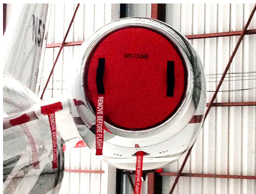
Citation CJ4 Intake Plugs pair

The Engine Inlet Plugs are custom fit for your Cessna Citationjet 525A, CJ-2, & CJ2+ intakes, made with heavy-duty vinyl material, and stuffed with a single block of sculpted urethane foam. Each plug has a zipper that allows the foam to be removed and dried if necessary. Engine plugs have 'remove before flight' streamers sewn onto the face of the plugs. Most plugs are imprinted with the aircraft registration number in black for an extra charge. Storage bag NOT included. Engine plugs may be inserted after flight when the engine is still warm. Engine Inlet Plugs are commonly referred to as Cowl Plugs, Intake Plugs, Cowl Blocks, Engine Blocks, and Engine Bungs.