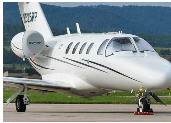
Cessna Citationjet CJ1 Bikini Type Engine Covers