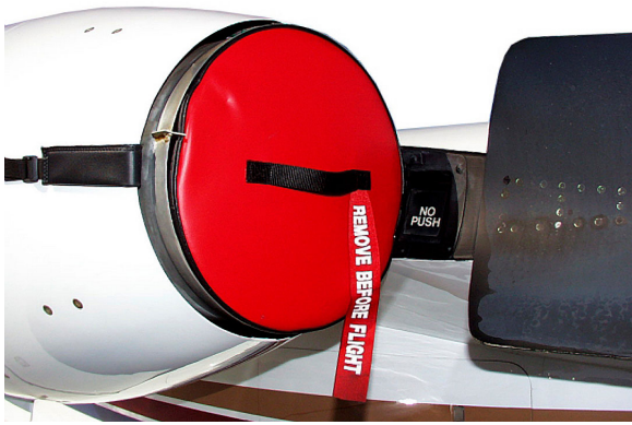
Engine Exhaust Plug