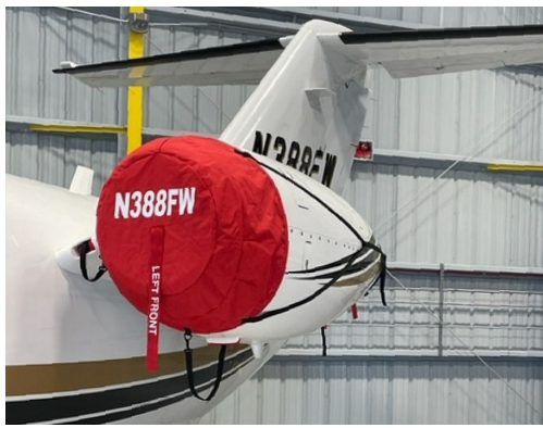
Cessna Citationjet 525 Intake Cover with Plugs