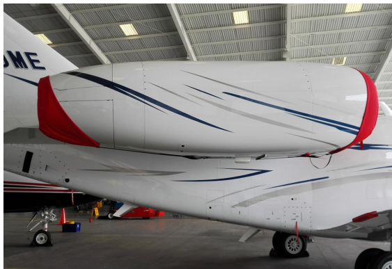
Citation X Intake/Exhaust Cover Set

The Cessna Citation X (750) Intake Covers are designed to install easily yet be completely storable. A spring steel hoop is sewn into the hem of each cover, allowing them to be installed without climbing onto the wing or using a stepladder. To store the covers the spring steel hoop folds like a band-saw blade into three nesting rings. Each cover folds into a compact circular bundle which is stored in the included duffel bag, yet they unfold quickly for use. The Tri-Fold Ring cover is made of medium weight nylon which is available in a variety of colors to match the paint trim. Each cover set comes complete with installation and folding instructions. The aircraft's registration number can be silkscreened onto the cover for an extra charge.