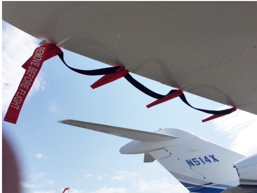
Citation X Static Wick Protectors

The Engine Exhaust Plugs are custom fit for your Cessna Citation X (750) exhaust openings, made with heavy-duty vinyl material, and stuffed with a single block of sculpted urethane foam. Each plug has a zipper that allows the foam to be removed and dried if necessary. Exhaust plugs have 'remove before flight' streamers sewn onto the face of the plugs. Most plugs are imprinted with the aircraft registration number in black for an extra charge. Exhaust plugs may be inserted soon after flight when the engine is still warm. Engine Inlet Plugs are commonly referred to as Cowl Plugs, Intake Plugs, Cowl Blocks, Engine Blocks, and Engine Bungs.