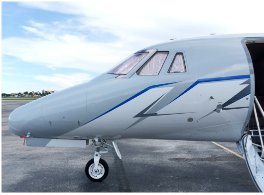
Cessna Citation 650 Cockpit HeataShields