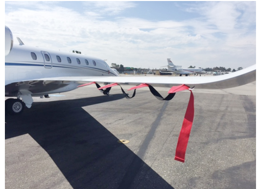
Citation X Static Wick Protectors