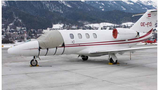
Cessna Citationjet CJ1 Cockpit Cover