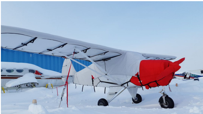
1957 PA-22-150 Over the Top Style Canopy Cover