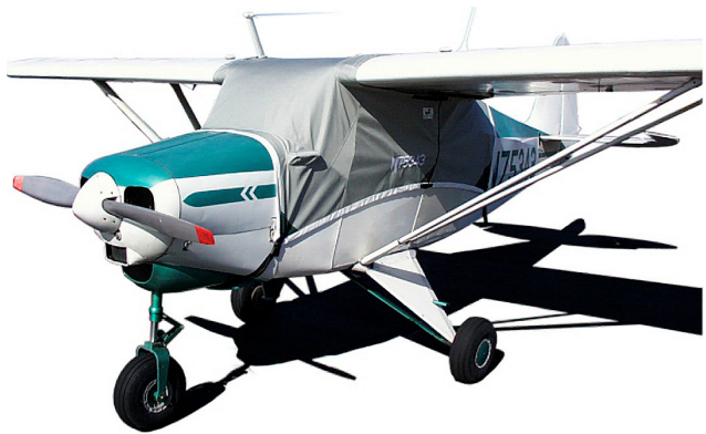
Tri-Pacer Over-the-Top Canopy Cover

occasional use outside. We also have an ultra lightweight material available for fitted hangar dust covers. For daily outdoor use, the non-travel Sunbrella Cover is the best choice.