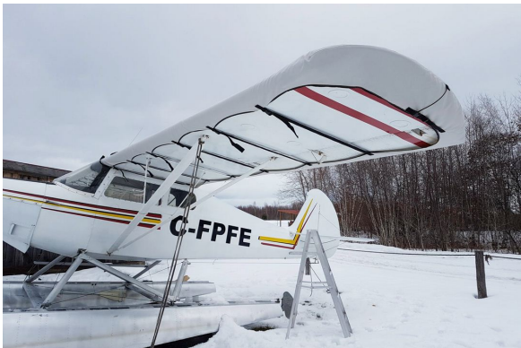
Christavia MK1 Wing Covers

WINTER USE MATERIAL - Made with Solution-Dyed Polyester fabric, this option is intended for seasonal use to aid in deicing, rain mitigation, or for occasional travel. The material is lighter and more compact, but more susceptible to UV damage and may have a shorter useful life if used continuously outside than the all-year use material.