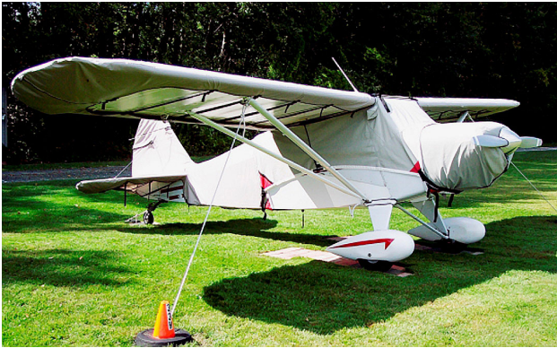
Piper Clipper Canopy, Engine, Empennage & Wing Covers