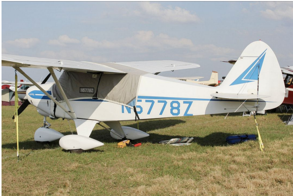
Piper PA-22-108 Canopy Cover, Over-Top Type

This cover type is made from Silver Acrylic Sunbrella canvas and is 100% lined with a soft and smooth microfiber. Bruce's Custom Covers developed this material combination especially for aircraft protection. The outer material is medium weight and treated for water resistance, UV resistance and anti-static buildup. The inner lining is a very soft and smooth microfiber to prevent scratching. The material is very reflective, and tests show that the cabin interior temperature can be reduced to near-ambient temperature on the hottest of days. It is water, ice and snow repellent, yet breathable to allow moisture to escape from between the cover and the aircraft surface.