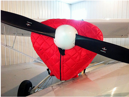
Piper PA-18 Super Cub Insulated Engine Cover

Insulated Covers Material - A special composite material of solution-dyed polyester, 3M Thinsulate insulation, and soft nylon interior fabric. Our insulated covers are designed to complement an engine preheater and help retain heat in the engine compartment after shutdown. If you operate your aircraft in cold-weather, these covers will help prevent engine wear and tear.