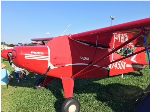
Piper Pacer Canopy Cover