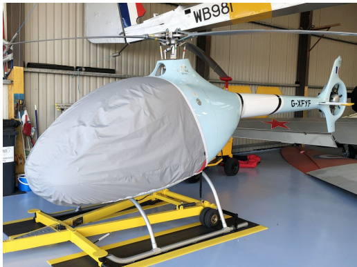
Cabri G2 Light Weight Travel Bubble Cover

Travel Covers are made with Silver Solution-Dyed Polyester fabric and fully lined over the entire cover. The material is lightweight and more compact for easy stowage in the aircraft. The polyester material is water resistant, but only intended for occasional use outside. We also have an ultra lightweight material available for fitted hangar dust covers. For daily outdoor use, the non-travel Sunbrella Cover is the best choice.