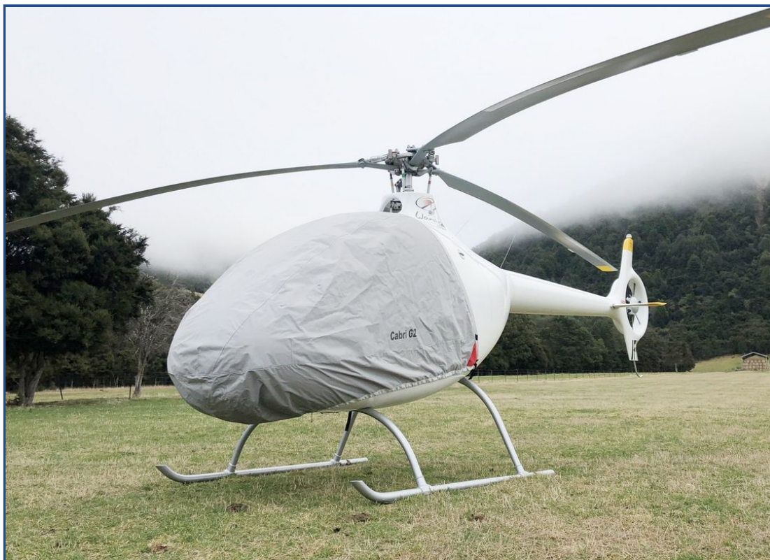
Guimbal Cabri CG2 Bubble Cover, light weight travel type