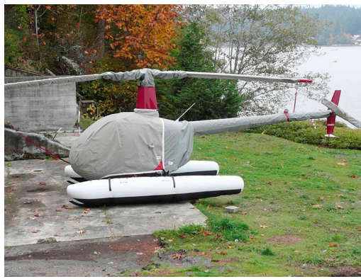
Robinson R-22 Bubble Cover (Ext. Past Rotor Hub), Engine Cover, Tailboom Cover, Blade Covers, Rotor Hub Cover, & Tail Rotor Gear Box Cover