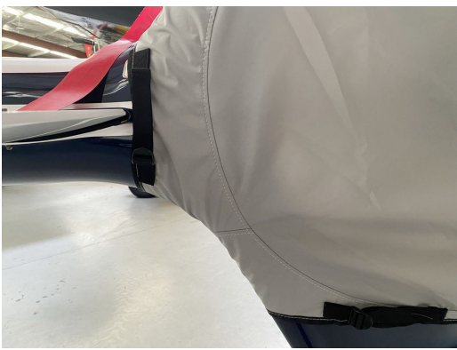
Robinson R-22 Engine, Rotor Mast & Tail Rotor Covers, with Blade Tie-down Guimbal Cabri G2 Tailfan Housing Fenestron Cover