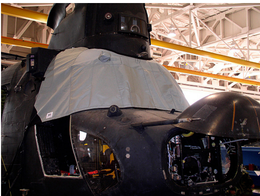
Boeing Vertol CH-47 Windshield/Cockpit Cover