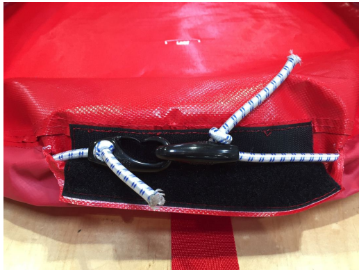
Boeing Vertol CH-47 Chinook Engine Exhaust Covers