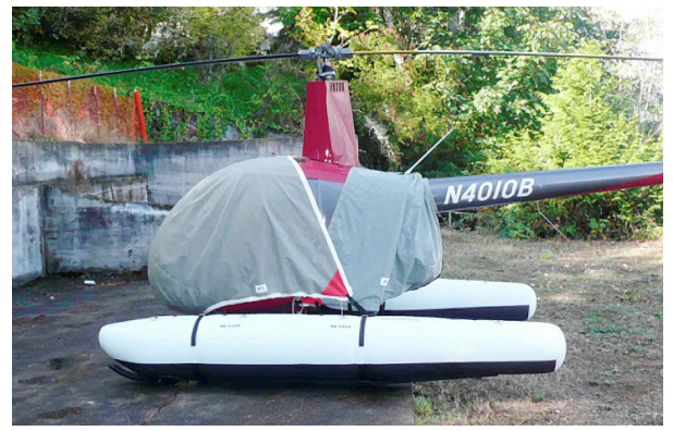
Robinson R-22 Standard Bubble Cover & Engine Cover