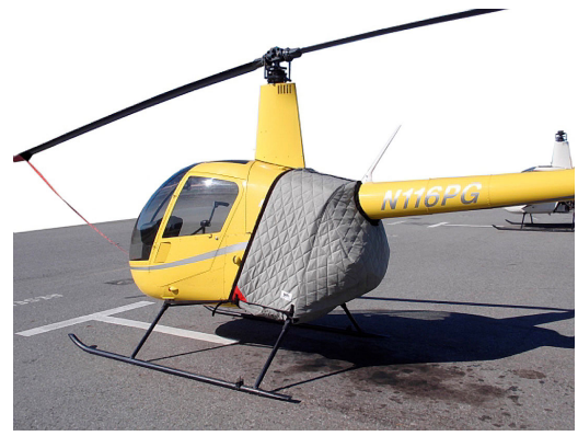
Robinson R-22 Insulated Engine Cover (also covers bottom) & Front Blade Tie-down