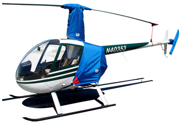
Robinson R-22 Engine, Rotor Mast & Tail Rotor Covers, with Blade Tie-down