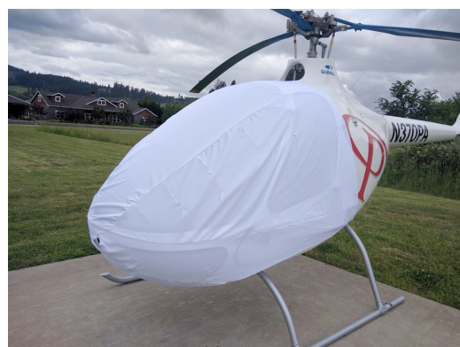
Guimbal Cabri G2 Bubble Cover, test fit cover