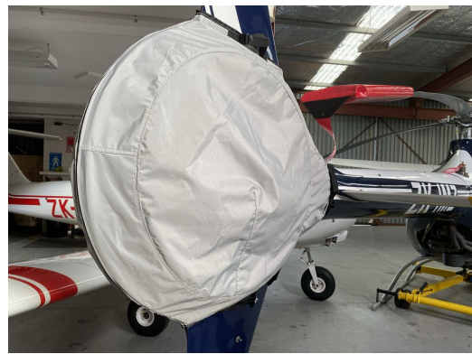
Guimbal Cabri G2 Tailfan Housing Fenestron Cover