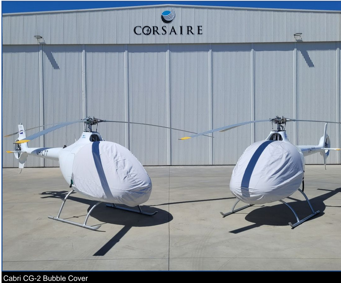
Cabri CG-2 Bubble Cover