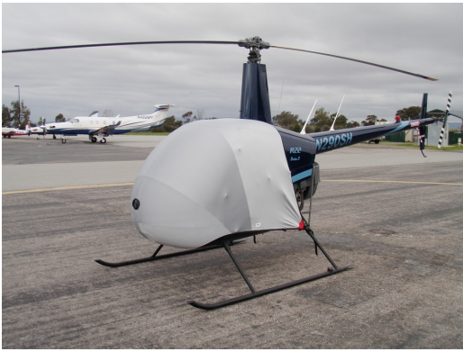
Robinson R-22 Light Weight Travel Cover