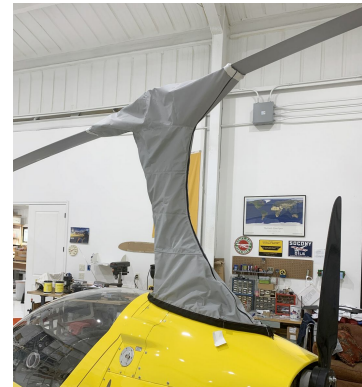
Autogyro Calidus Gyrocopter Rotor Hub/Mast Cover