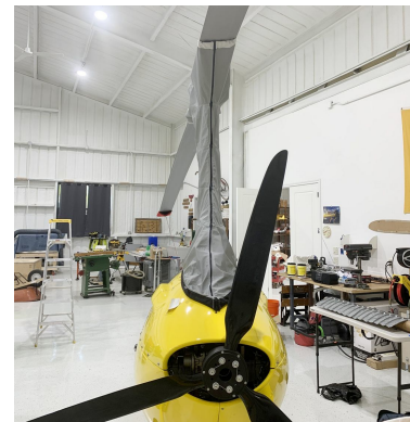
Autogyro Calidus Gyrocopter Rotor Hub/Mast Cover