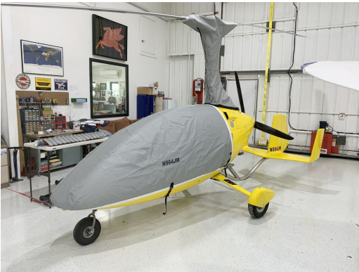
Autogyro Calidus Gyrocopter Canopy/Nose & Rotor Hub/Mast Cover

Rotor Hub Covers overlaps with the Blade Covers to ensure complete protection for the entire main rotor system. Designed like a jacket with sleeves and no collar, the rotor hub cover fastens together below each blade with Delrin buckles. The Rotor Hub Cover is normally made from Solution-Dyed Polyester.