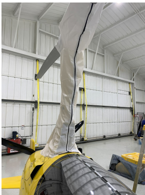
Calidus Gyrocopter Rotor Mast Cover, test fit cover

Rotor Hub Covers overlaps with the Blade Covers to ensure complete protection for the entire main rotor system. Designed like a jacket with sleeves and no collar, the rotor hub cover fastens together below each blade with Delrin buckles. The Rotor Hub Cover is normally made from Solution-Dyed Polyester.