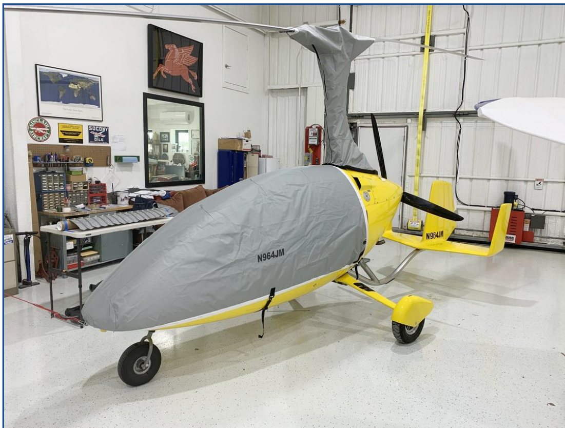
Autogyro Calidus Gyrocopter Canopy/Nose &amp; Rotor Hub/Mast Cover