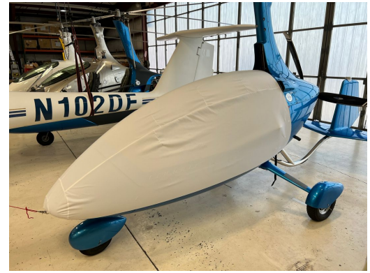
Autogyro Calidus Canopy/Nose Cover, test fit cover