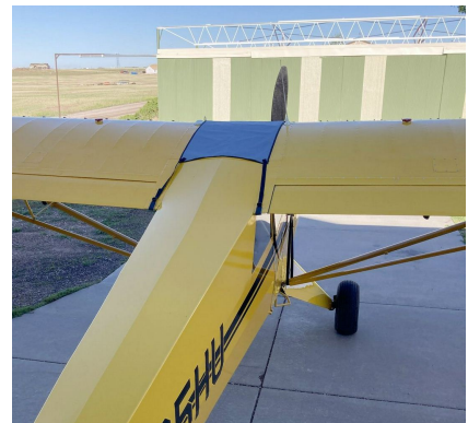
Aviat Husky Windshield/Skylight Cover