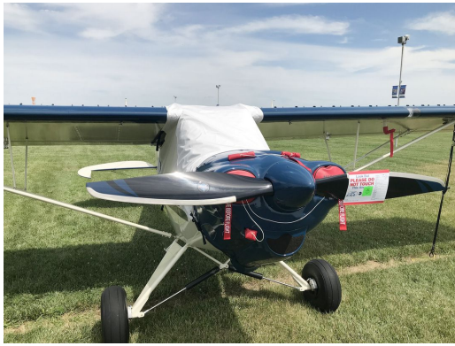
Cub Crafters EX2 Canopy Cover, Engine Plugs