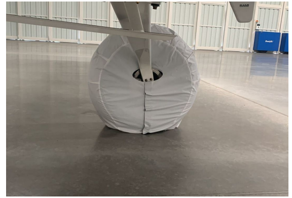
Piper PA-18 Super Cub Extended Canopy Cover, Wing & Tire Covers Cub Crafters Tire Covers, tricycle gear, test fit covers