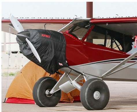
Cub Crafters Carbon Cub Insulated Engine Cover