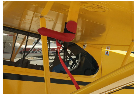
Cub Crafters CC-11 Carbon Cub Pitot Cover