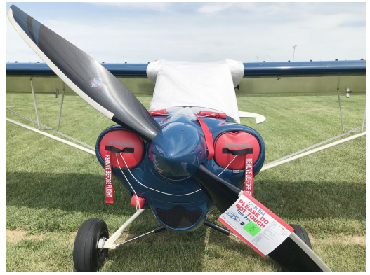
Cub Crafters EX2 Canopy Cover, Engine Plugs