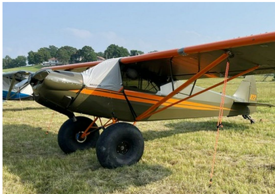
Cub Crafters CC18 Windshield/Skylight Cover

This cover type is made from Silver Acrylic Sunbrella canvas and is 100% lined with a soft and smooth microfiber. Bruce's Custom Covers developed this material combination especially for aircraft protection. The outer material is medium weight and treated for water resistance, UV resistance and anti-static buildup. The inner lining is a very soft and smooth microfiber to prevent scratching. The material is very reflective, and tests show that the cabin interior temperature can be reduced to near-ambient temperature on the hottest of days. It is water, ice and snow repellent, yet breathable to allow moisture to escape from between the cover and the aircraft surface.