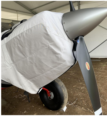
Cub Crafters CC-19 Engine Cover