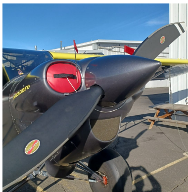
CubCrafters FX-3 Engine Inlet Plugs

Engine Inlet Plugs are custom fit for your CubCrafters CC-18, 19, 20, Top Cub, CCK-1865, CC-19 X-Cub, CCX-2000, EX-3, FX-3 intakes, made with heavy-duty vinyl material, and stuffed with a single block of sculpted urethane foam. Each plug has a zipper that allows the foam to be removed and dried if necessary. Engine plugs have warning flags that are visible from the cockpit or 'remove before flight' streamers sewn onto the face of the plugs. Most plugs are imprinted with the aircraft registration number in black for an extra charge. Storage bag NOT included. Engine plugs may be inserted after flight when the engine is still warm. Engine Inlet Plugs are commonly referred to as Cowl Plugs, Intake Plugs, Cowl Blocks, Engine Blocks, and Engine Bungs.