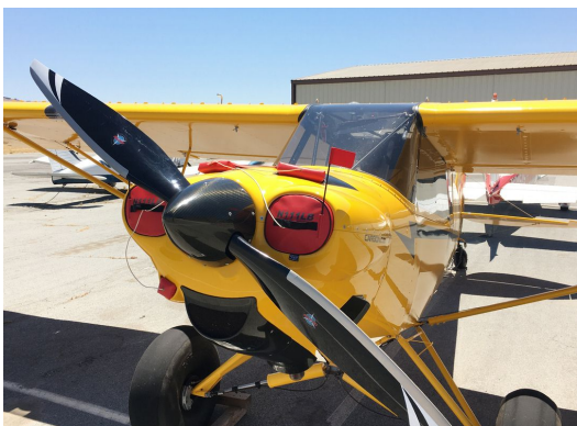
Cub Crafters CC-11 Carbon Cub Engine Plugs

Engine Inlet Plugs are custom fit for your CubCrafters CC-18, 19, 20, Top Cub, CCK-1865, CC-19 X-Cub, CCX-2000, EX-3, FX-3 intakes, made with heavy-duty vinyl material, and stuffed with a single block of sculpted urethane foam. Each plug has a zipper that allows the foam to be removed and dried if necessary. Engine plugs have warning flags that are visible from the cockpit or 'remove before flight' streamers sewn onto the face of the plugs. Most plugs are imprinted with the aircraft registration number in black for an extra charge. Storage bag NOT included. Engine plugs may be inserted after flight when the engine is still warm. Engine Inlet Plugs are commonly referred to as Cowl Plugs, Intake Plugs, Cowl Blocks, Engine Blocks, and Engine Bungs.