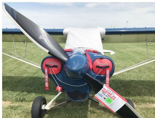
Cubcrafters CC-18 Engine Inlet Plugs