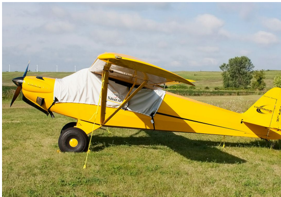
Cub Crafters Canopy Cover

This cover type is made from Silver Acrylic Sunbrella canvas and is 100% lined with a soft and smooth microfiber. Bruce's Custom Covers developed this material combination especially for aircraft protection. The outer material is medium weight and treated for water resistance, UV resistance and anti-static buildup. The inner lining is a very soft and smooth microfiber to prevent scratching. The material is very reflective, and tests show that the cabin interior temperature can be reduced to near-ambient temperature on the hottest of days. It is water, ice and snow repellent, yet breathable to allow moisture to escape from between the cover and the aircraft surface.