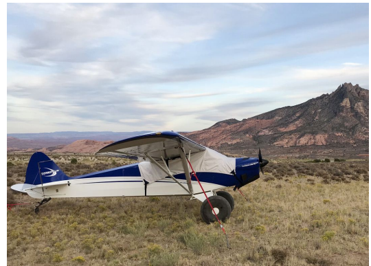
Cub Crafters CC-18 Canopy Cover