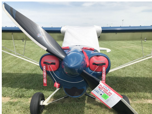
Cub Crafters EX2 Canopy Cover, Engine Plugs

Engine Inlet Plugs are custom fit for your CubCrafters CC-18, 19, 20, Top Cub, CCK-1865, CC-19 X-Cub, CCX-2000, EX-3, FX-3 intakes, made with heavy-duty vinyl material, and stuffed with a single block of sculpted urethane foam. Each plug has a zipper that allows the foam to be removed and dried if necessary. Engine plugs have warning flags that are visible from the cockpit or 'remove before flight' streamers sewn onto the face of the plugs. Most plugs are imprinted with the aircraft registration number in black for an extra charge. Storage bag NOT included. Engine plugs may be inserted after flight when the engine is still warm. Engine Inlet Plugs are commonly referred to as Cowl Plugs, Intake Plugs, Cowl Blocks, Engine Blocks, and Engine Bunges.