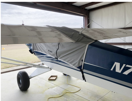
Cub Crafters Carbon Cub Travel Weight Canopy Cover

This cover type is made from Silver Acrylic Sunbrella canvas and is 100% lined with a soft and smooth microfiber. Bruce's Custom Covers developed this material combination especially for aircraft protection. The outer material is medium weight and treated for water resistance, UV resistance and anti-static buildup. The inner lining is a very soft and smooth microfiber to prevent scratching. The material is very reflective, and tests show that the cabin interior temperature can be reduced to near-ambient temperature on the hottest of days. It is water, ice and snow repellent, yet breathable to allow moisture to escape from between the cover and the aircraft surface.