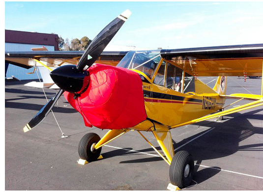
Aviat Husky Insulated Engine Cover