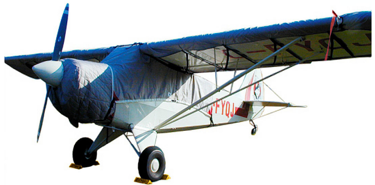
Aviat Husky Insulated Engine Cover, Canopy & Wing Covers