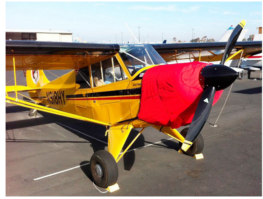
Aviat Husky Insulated Engine Cover