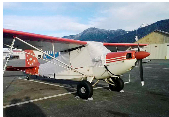
Bellanca Citabria Over-Top Canopy Cover, extended to tail