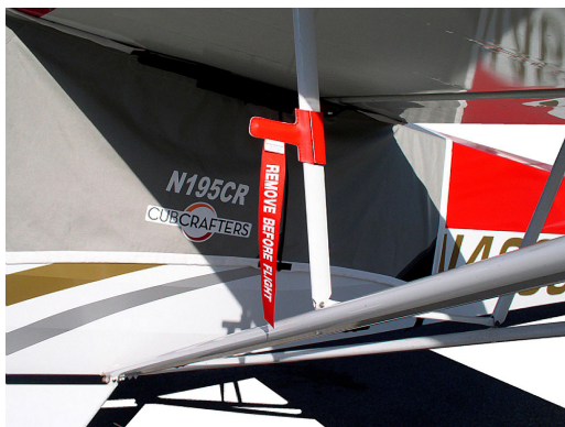
Cub Crafters Sport Cub Pitot Cover

Engine Inlet Plugs are custom fit for your CubCrafters CC-11, Sport Cub S2, & Carbon Cub intakes, made with heavy-duty vinyl material, and stuffed with a single block of sculpted urethane foam. Each plug has a zipper that allows the foam to be removed and dried if necessary. Engine plugs have warning flags that are visible from the cockpit or 'remove before flight' streamers sewn onto the face of the plugs. Most plugs are imprinted with the aircraft registration number in black for an extra charge. Storage bag NOT included. Engine plugs may be inserted after flight when the engine is still warm. Engine Inlet Plugs are commonly referred to as Cowl Plugs, Intake Plugs, Cowl Blocks, Engine Blocks, and Engine Bungs.