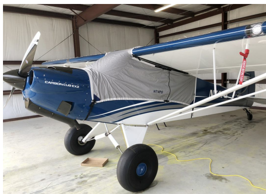
Cub Crafters CC19 X-Cub Engine Cover, Travel Weight Canopy Cover Cub Crafters Carbon Cub Travel Weight Canopy Cover