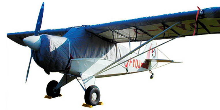
Aviat Husky Insulated Engine Cover, Canopy & Wing Covers

WINTER USE MATERIAL - Made with Solution-Dyed Polyester fabric, this option is intended for seasonal use to aid in deicing, rain mitigation, or for occasional travel. The material is lighter and more compact, but more susceptible to UV damage and may have a shorter useful life if used continuously outside than the all-year use material.