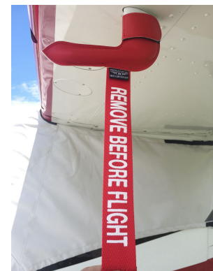
Cessna A185F Pitot Cover