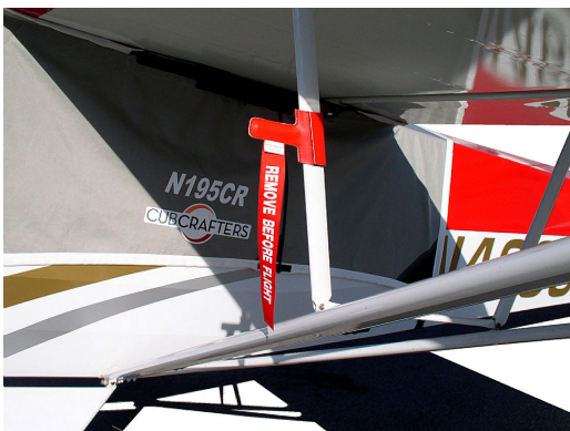
Cub Crafters Sport Cub Pitot Cover

This cover type is made from Silver Acrylic Sunbrella canvas and is 100% lined with a soft and smooth microfiber. Bruce's Custom Covers developed this material combination especially for aircraft protection. The outer material is medium weight and treated for water resistance, UV resistance and anti-static buildup. The inner lining is a very soft and smooth microfiber to prevent scratching. The material is very reflective, and tests show that the cabin interior temperature can be reduced to near-ambient temperature on the hottest of days. It is water, ice and snow repellent, yet breathable to allow moisture to escape from between the cover and the aircraft surface.