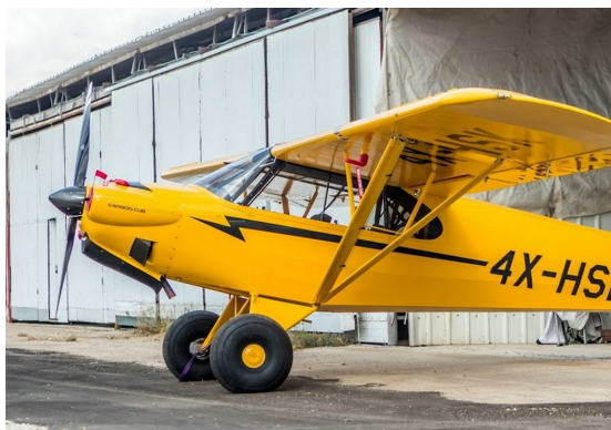
Cub Crafters Carbon Cub SS Engine Inlet Plugs & Pitot Cover

Engine Inlet Plugs are custom fit for your CubCrafters CC-11, Sport Cub S2, & Carbon Cub intakes, made with heavy-duty vinyl material, and stuffed with a single block of sculpted urethane foam. Each plug has a zipper that allows the foam to be removed and dried if necessary. Engine plugs have warning flags that are visible from the cockpit or 'remove before flight' streamers sewn onto the face of the plugs. Most plugs are imprinted with the aircraft registration number in black for an extra charge. Storage bag NOT included. Engine plugs may be inserted after flight when the engine is still warm. Engine Inlet Plugs are commonly referred to as Cowl Plugs, Intake Plugs, Cowl Blocks, Engine Blocks, and Engine Bungs.