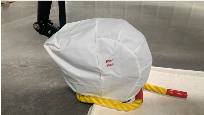
Cub Crafters Tire Covers, tricycle gear, test fit covers

ALL-YEAR USE MATERIAL - Made with Silver Acrylic Sunbrella canvas, the all-year use material is the best option for sun protection and cover longevity. This heavier more durable material is intended for all weather conditions, such as rain and snow or lots of sun.