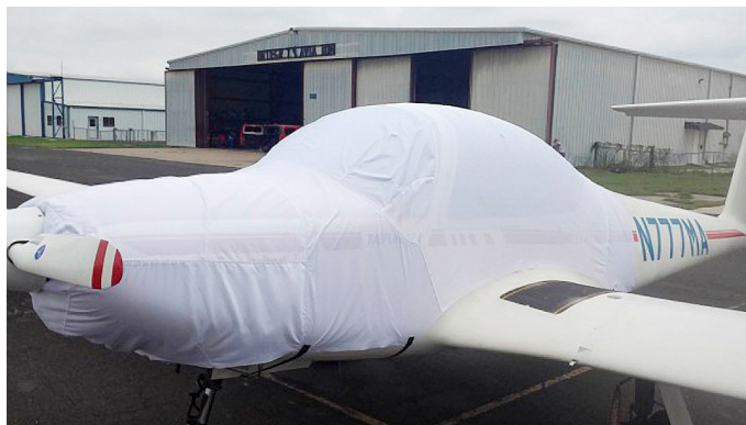
Taifun 17E Canopy/Engine Cover, test fit cover