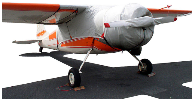
Cessna 195 Over-Top Canopy, Engine & Prop Covers