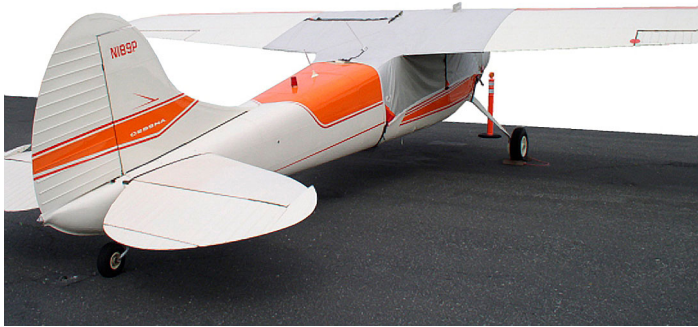
Cessna 195 Over-Top Canopy, Engine & Prop Covers

The material is very reflective, and tests show that the cabin interior temperature can be reduced to near-ambient temperature on the hottest of days. It is water, ice and snow repellent, yet breathable to allow moisture to escape from between the cover and the aircraft surface.