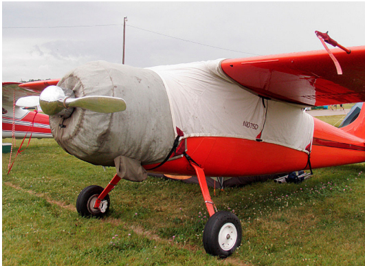
Cessna 195 Over-Top Canopy Cover & Engine Cover