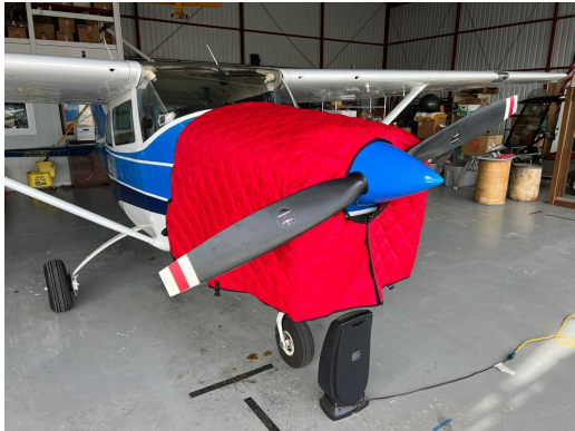
Insulated Hangar Blanket on Cessna 182

water resistance, UV resistance and anti-static buildup. The inner lining is a very soft and smooth microfiber to prevent scratching. The material is very reflective, and tests show that the cabin interior temperature can be reduced to near-ambient temperature on the hottest of days. It is water, ice and snow repellent, yet breathable to allow moisture to escape from between the cover and the aircraft surface.