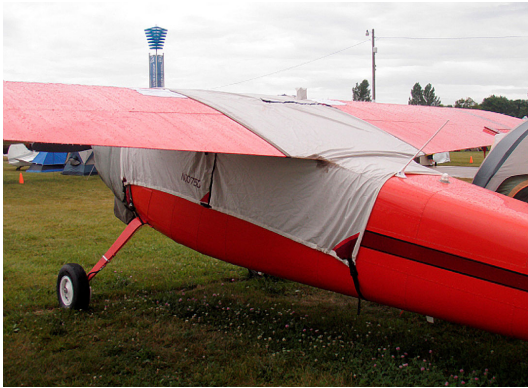
Over-Top Canopy Cover & Engine Cover