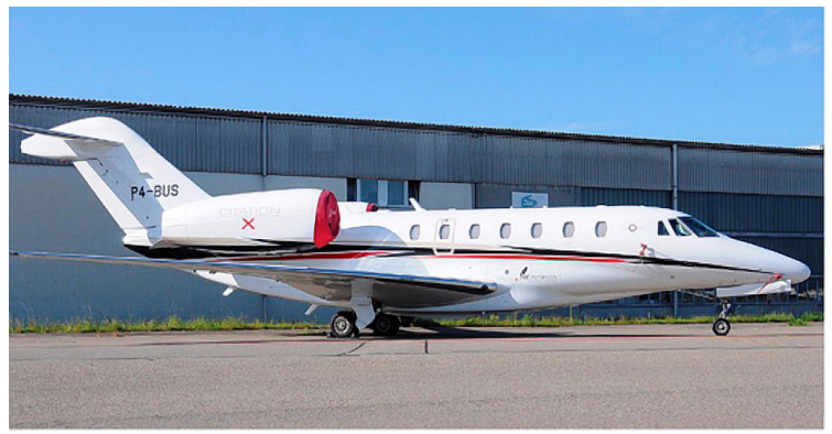
Citation X Intake & Pitot Tube Covers