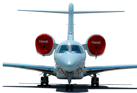
Citation X Intake Covers

which is stored in the included duffle bag, yet they unfold quickly for use. The Tri-Fold Ring cover is made of medium weight nylon which is available in a variety of colors to match the paint trim. Each cover set comes complete with installation and folding instructions. The aircraft's registration number can be silkscreened onto the cover for an extra charge.