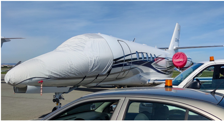
Cessna Citation Latitude (680A) Cockpit/Nose Cover, Doesn't Cover Pitot Tubes