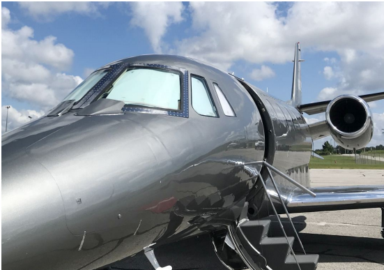
Cessna Citation 560XL Cockpit HeatShields