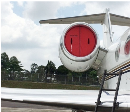
Grumman Gulfstream G450 Intake Plugs

The Engine Inlet Plugs are custom fit for your Cessna Citation Latitude (680A) intakes, made with heavy-duty vinyl material, and stuffed with a single block of sculpted urethane foam. Each plug has a zipper that allows the foam to be removed and dried if necessary. Engine plugs have 'remove before flight' streamers sewn onto the face of the plugs. Most plugs are imprinted with the aircraft registration number in black for an extra charge. Storage bag NOT included. Engine plugs may be inserted after flight when the engine is still warm. Engine Inlet Plugs are commonly referred to as Cowl Plugs, Intake Plugs, Cowl Blocks, Engine Blocks, and Engine Bungs.