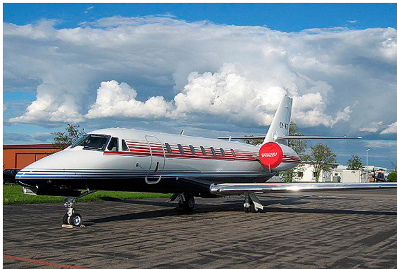
Citation Sovereign Engine Covers

The Cessna Citation Latitude (680A) Intake/Exhaust Plugs are custom fit for the intake and exhaust openings, made with heavy-duty vinyl material, and stuffed with a single block of sculpted urethane foam. Each plug has a zipper that allows the foam to be removed and dried if necessary. Engine plugs have 'remove before flight' streamers sewn onto the face of the plugs. Most plugs are imprinted with the aircraft registration number in black. Engine plugs may be inserted after flight when the engine is still warm. Engine Inlet Plugs are commonly referred to as Cowl Plugs, Intake Plugs, Cowl Blocks, Engine Blocks, and Engine Bungs.