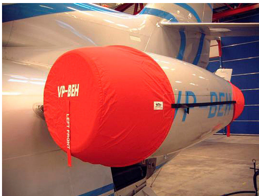
Falcon 900 Sovereign Engine Covers

The Cessna Citation Latitude (680A) Intake/Exhaust Plugs are custom fit for the intake and exhaust openings, made with heavy-duty vinyl material, and stuffed with a single block of sculpted urethane foam. Each plug has a zipper that allows the foam to be removed and dried if necessary. Engine plugs have 'remove before flight' streamers sewn onto the face of the plugs. Most plugs are imprinted with the aircraft registration number in black. Engine plugs may be inserted after flight when the engine is still warm. Engine Inlet Plugs are commonly referred to as Cowl Plugs, Intake Plugs, Cowl Blocks, Engine Blocks, and Engine Bungs.