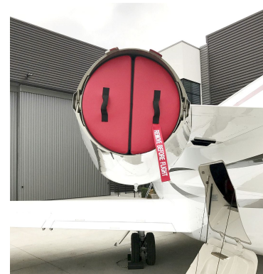
Cessna Citation 680 Exhaust Plugs, folding type