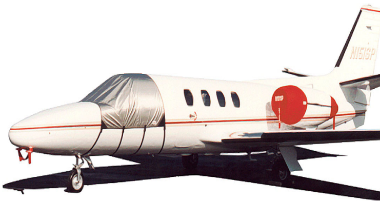
Cessna Citation I Windshield, Pitot and Engine Covers