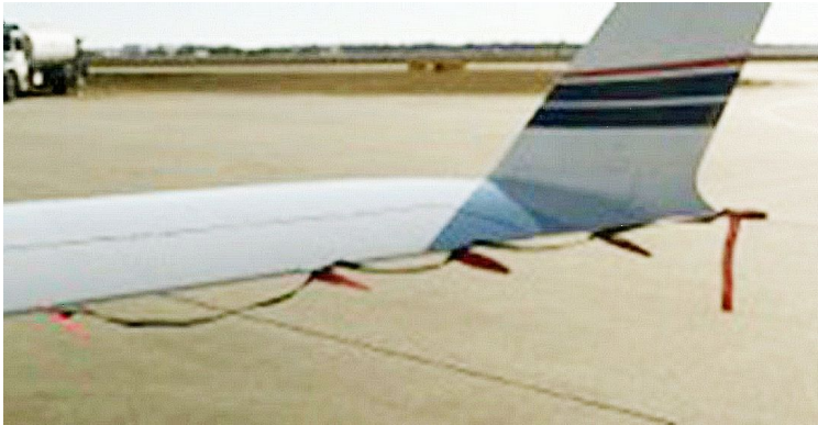
Static Wick Covers