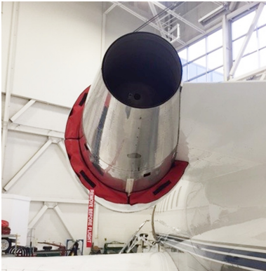
Canadair Challenger 604 Bypass Plugs

with the aircraft registration number in black for an extra charge. Storage bag NOT included. Engine plugs may be inserted after flight when the engine is still warm. Engine Inlet Plugs are commonly referred to as Cowl Plugs, Intake Plugs, Cowl Blocks, Engine Blocks, and Engine Bungs.