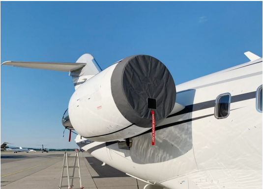
Canadair Challenger 604, 605, 650, 850 Intake/Exhaust Covers (OEM Design)