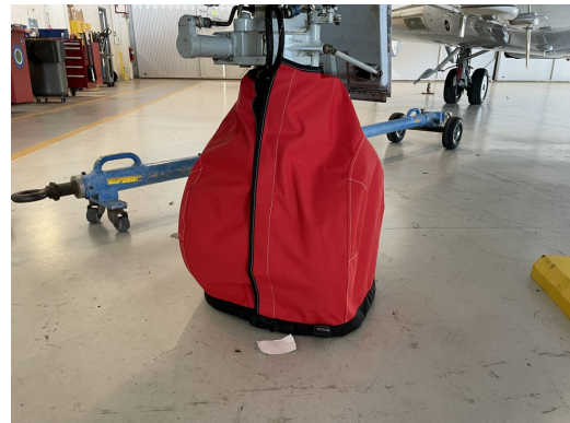
Canadair Challenger 605 Nose Gear Tire Cover