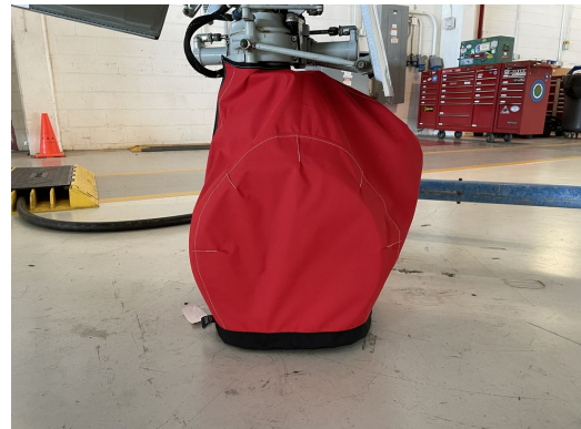
Canadair Challenger 605 Nose Gear Tire Cover