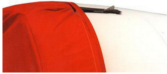
Alternate Intake Cover Design