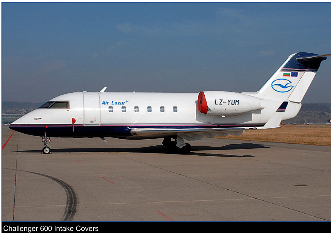
Challenger 600 Intake Covers