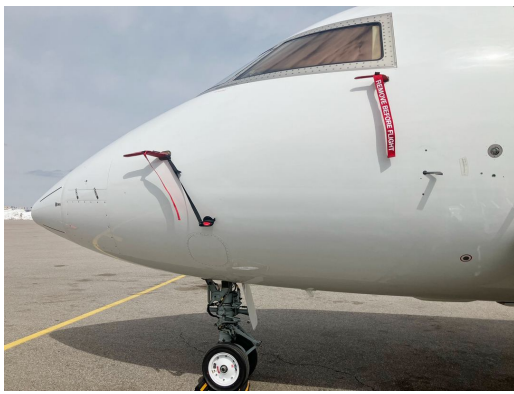
Challenger 650 Pitot & Ice Detector Covers