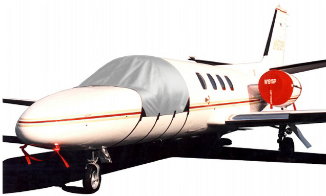
Cessna Citation Windshield Cover, Engine Cover set and Pitot Covers