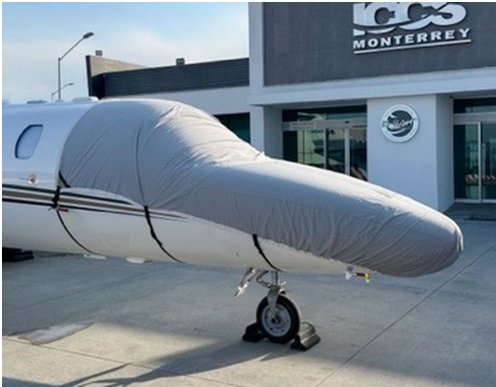
Cessna Citation Windshield Cover, Engine Cover set and Pitot Covers Cessna Citationjet 525B Travel Weight Cockpit/Nose Cover