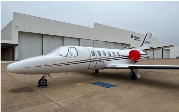
Cessna 550 Intake Covers & Exhaust Plugs, includes wedge plug for nacelle recommended (set of 6)