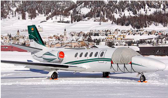
Cessna Citation 550 Windshield Cover