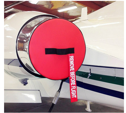
Cessna Citation S2 Exhaust Plugs