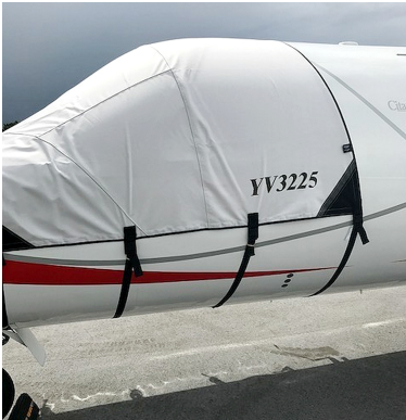
Cessna Citationjet V Ultra (560) Cockpit Cover

This cover type is made from Silver Acrylic Sunbrella canvas and is 100% lined with a soft and smooth microfiber. Bruce's Custom Covers developed this material combination especially for aircraft protection. The outer material is medium weight and treated for water resistance, UV resistance and anti-static buildup. The inner lining is a very soft and smooth microfiber to prevent scratching. The material is very reflective, and tests show that the cabin interior temperature can be reduced to near-ambient temperature on the hottest of days. It is water, ice and snow repellent, yet breathable to allow moisture to escape from between the cover and the aircraft surface.