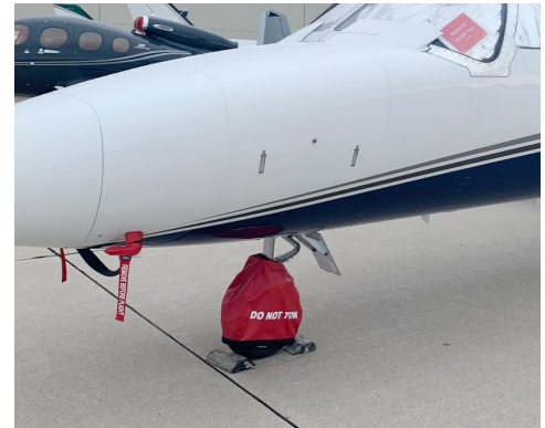
Cessna Citation Nose Tire Cover