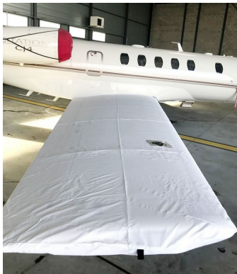
Cessna Citation CJ-4 Wing Covers, test fit cover

WINTER USE MATERIAL - Made with Solution-Dyed Polyester fabric, this option is intended for seasonal use to aid in deicing, rain mitigation, or for occasional travel. The material is lighter and more compact, but more susceptible to UV damage and may have a shorter useful life if used continuously outside than the all-year use material.