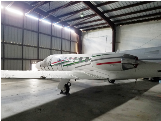
Cessna Citation II Cockpit Cover, Wing Covers