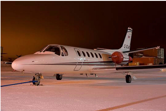
Cessna Citation 550 Engine Cover Set