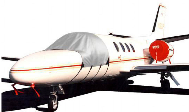
Citation Windshield Cover, Engine Cover set and Pitot Covers

The Engine Inlet Plugs are custom fit for your Cessna Citationjet V Ultra & Encore Models intakes, made with heavy-duty vinyl material, and stuffed with a single block of sculpted urethane foam. Each plug has a zipper that allows the foam to be removed and dried if necessary. Engine plugs have 'remove before flight' streamers sewn onto the face of the plugs. Most plugs are imprinted with the aircraft registration number in black for an extra charge. Storage bag NOT included. Engine plugs may be inserted after flight when the engine is still warm. Engine Inlet Plugs are commonly referred to as Cowl Plugs, Intake Plugs, Cowl Blocks, Engine Blocks, and Engine Bungs.