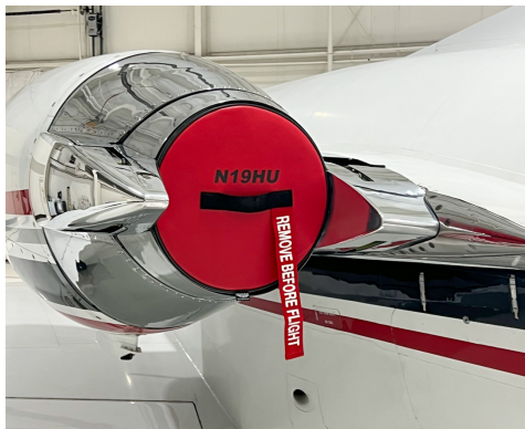
Citationjet V Ultra (560) Exhaust Plugs (set of 2)

The Engine Inlet Plugs are custom fit for your Cessna Citationjet V Ultra & Encore Models intakes, made with heavy-duty vinyl material, and stuffed with a single block of sculpted urethane foam. Each plug has a zipper that allows the foam to be removed and dried if necessary. Engine plugs have 'remove before flight' streamers sewn onto the face of the plugs. Most plugs are imprinted with the aircraft registration number in black for an extra charge. Storage bag NOT included. Engine plugs may be inserted after flight when the engine is still warm. Engine Inlet Plugs are commonly referred to as Cowl Plugs, Intake Plugs, Cowl Blocks, Engine Blocks, and Engine Bungs.