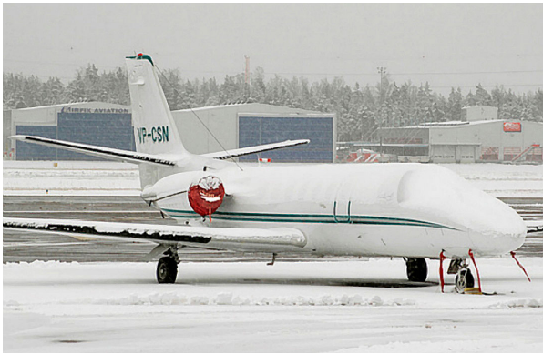
Cessna 551 Citation II SP Engine covers (with thrust reversers, smooth gen. inlet) Cessna 560 Engine Inlet/Exhaust Covers, Pitot Cover Set