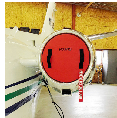
Cessna Citation S2 Intake Plugs