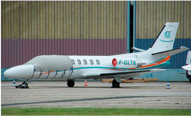
Citation Windshield Cover, to back of door

This cover type is made from Silver Acrylic Sunbrella canvas and is 100% lined with a soft and smooth microfiber. Bruce's Custom Covers developed this material combination especially for aircraft protection. The outer material is medium weight and treated for water resistance, UV resistance and anti-static buildup. The inner lining is a very soft and smooth microfiber to prevent scratching. The material is very reflective, and tests show that the cabin interior temperature can be reduced to near-ambient temperature on the hottest of days. It is water, ice and snow repellent, yet breathable to allow moisture to escape from between the cover and the aircraft surface.