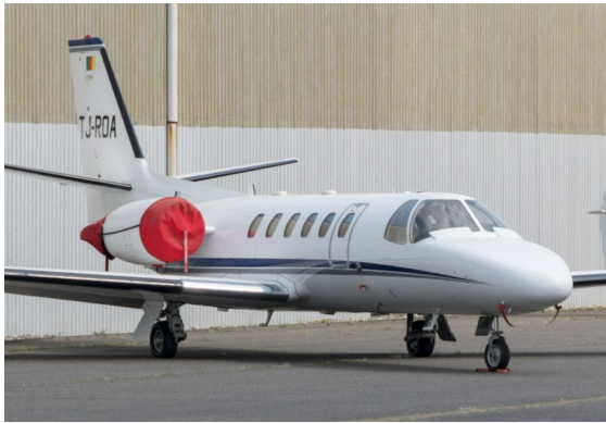
Cessna Citation II Bravo Engine Covers

The Cessna Citation II (550, 551, UC-35A, with JT15D) Intake Covers are designed to install easily yet be completely storable. A spring steel hoop is sewn into the hem of each cover, allowing them to be installed without climbing onto the wing or using a stepladder. To store the covers the spring steel hoop folds like a band-saw blade into three nesting rings. Each cover folds into a compact circular bundle which is stored in the included duffel bag, yet they unfold quickly for use. The Tri-Fold Ring cover is made of medium weight nylon which is available in a variety of colors to match the paint trim. Each cover set comes complete with installation and folding instructions. The aircraft's registration number can be silkscreened onto the cover for an extra charge.