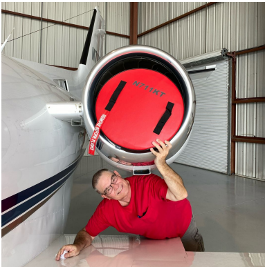
Citation II Engine Plugs

The Engine Inlet Plugs are custom fit for your Cessna Citation II (550, 551, UC-35A, with JT15D) intakes, made with heavy-duty vinyl material, and stuffed with a single block of sculpted urethane foam. Each plug has a zipper that allows the foam to be removed and dried if necessary. Engine plugs have 'remove before flight' streamers sewn onto the face of the plugs. Most plugs are imprinted with the aircraft registration number in black for an extra charge. Storage bag NOT included. Engine plugs may be inserted after flight when the engine is still warm. Engine Inlet Plugs are commonly referred to as Cowl Plugs, Intake Plugs, Cowl Blocks, Engine Blocks, and Engine Bungs.