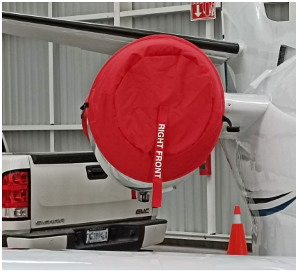
Cessna Citation S550 Intake/Exhaust Covers Cessna 551 Citation II SP Engine covers (with thrust reversers, smooth gen. inlet)