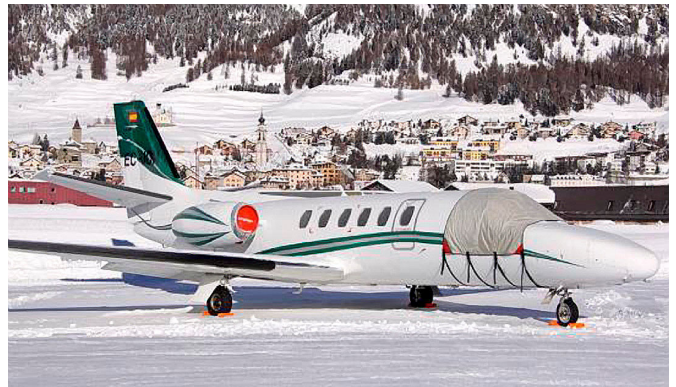
Cessna Citation 550 Windshield Cover