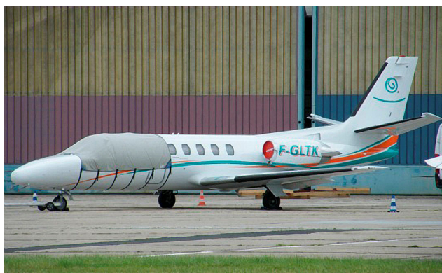
Citation Windshield Cover, to back of door