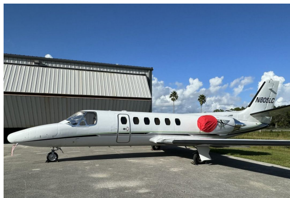
Cessna Citation 550 Intake Cover