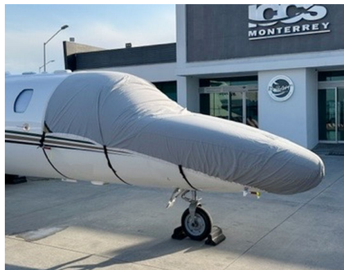
Cessna Citationjet 525B Travel Weight Cockpit/Nose Cover