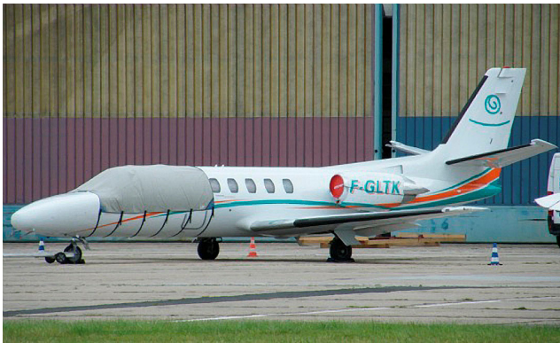
Citation Windshield Cover, to back of door

This cover type is made from Silver Acrylic Sunbrella canvas and is 100% lined with a soft and smooth microfiber. Bruce's Custom Covers developed this material combination especially for aircraft protection. The outer material is medium weight and treated for water resistance, UV resistance and anti-static buildup. The inner lining is a very soft and smooth microfiber to prevent scratching. The material is very reflective, and tests show that the cabin interior temperature can be reduced to near-ambient temperature on the hottest of days. It is water, ice and snow repellent, yet breathable to allow moisture to escape from between the cover and the aircraft surface.