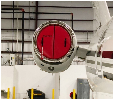
Embraer Legacy 500 Engine Inlet Plugs, folding type

The Engine Inlet Plugs are custom fit for your Cessna Citation II (550, 551, UC-35A, with JT15D) intakes, made with heavy-duty vinyl material, and stuffed with a single block of sculpted urethane foam. Each plug has a zipper that allows the foam to be removed and dried if necessary. Engine plugs have 'remove before flight' streamers sewn onto the face of the plugs. Most plugs are imprinted with the aircraft registration number in black for an extra charge. Storage bag NOT included. Engine plugs may be inserted after flight when the engine is still warm. Engine Inlet Plugs are commonly referred to as Cowl Plugs, Intake Plugs, Cowl Blocks, Engine Blocks, and Engine Bungs.