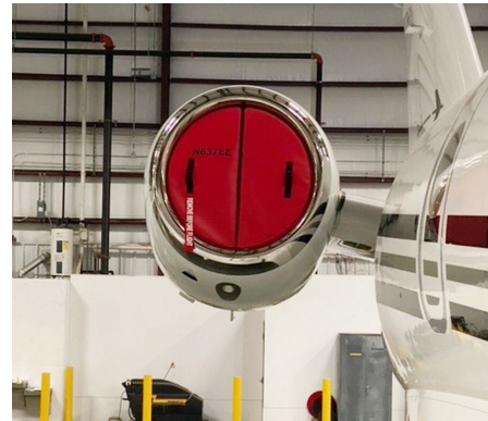
Embraer Legacy 500 Engine Inlet Plugs, folding type