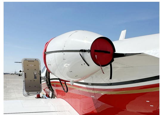
Cessna Citation Mustang 510 Intake Cover/Exhaust Plug Set