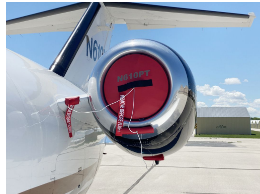
Cessna Citation Mustang 510 Engine Inlet Plugs, set of 8