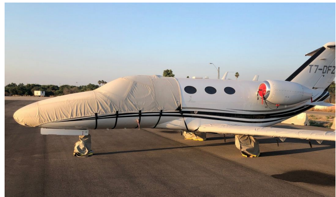
Cessna 510 Mustang Cockpit/Nose Cover, Engine Inlet Plugs