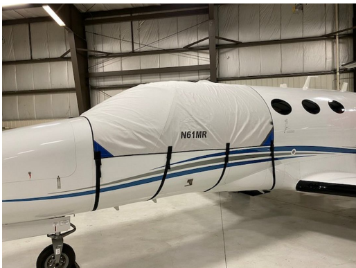
Cessna 510 Cockpit Cover extends to cover door

This cover type is made from Silver Acrylic Sunbrella canvas and is 100% lined with a soft and smooth microfiber. Bruce's Custom Covers developed this material combination especially for aircraft protection. The outer material is medium weight and treated for water resistance, UV resistance and anti-static buildup. The inner lining is a very soft and smooth microfiber to prevent scratching. The material is very reflective, and tests show that the cabin interior temperature can be reduced to near-ambient temperature on the hottest of days. It is water, ice and snow repellent, yet breathable to allow moisture to escape from between the cover and the aircraft surface.