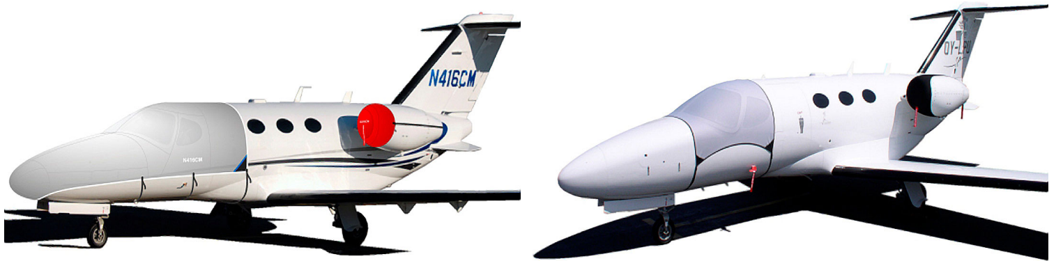
Citation Mustang Cockpit/Door/Nose Cover, Engine Inlet Cover Citation Mustang Light Weight Travel Windshield Cover, "Bikini" type Engine Cover Set

Travel Covers are made with Silver Solution-Dyed Polyester fabric and only lined over the windshield to save weight. The material is lightweight and more compact for easy stowage in the aircraft. The polyester material is water resistant, but only intended for occasional use outside. We also have an ultra lightweight material available for fitted hangar dust covers. For daily outdoor use, the non-travel Sunbrella Cover is the best choice.