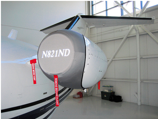
Citation Mustang Intake/Exhaust Cover, "Bikini" Type and leading edge Pylon inlet plugs