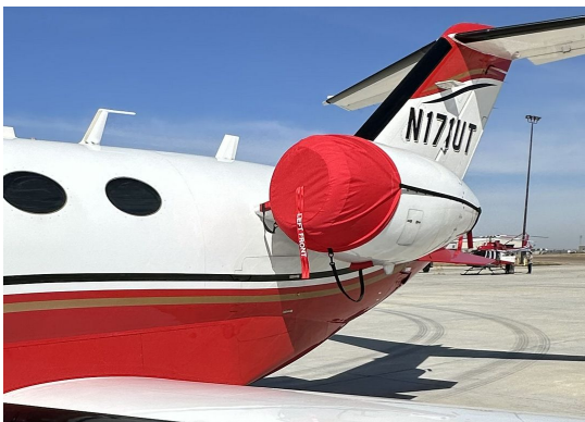
Cessna Citation Mustang 510 Intake Cover/Exhaust Plug Set

The Cessna Mustang 510 Intake/Exhaust Plugs are custom fit for the intake and exhaust openings, made with heavy-duty vinyl material, and stuffed with a single block of sculpted urethane foam. Each plug has a zipper that allows the foam to be removed and dried if necessary. Engine plugs have 'remove before flight' streamers sewn onto the face of the plugs. Most plugs are imprinted with the aircraft registration number in black. Engine plugs may be inserted after flight when the engine is still warm. Engine Inlet Plugs are commonly referred to as Cowl Plugs, Intake Plugs, Cowl Blocks, Engine Blocks, and Engine Bungs.