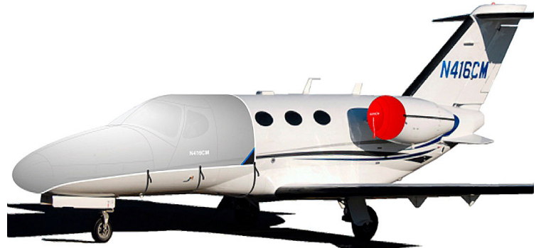
Citation Mustang Windshield Cover, Intake Cover/Exhaust Plug Set, Pitot Covers Citation Mustang Cockpit/Door/Nose Cover, Engine Inlet Cover