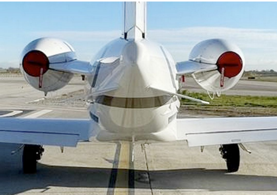
Cessna Mustang Exhaust Plugs