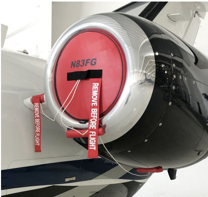
Cessna Mustang 510 Engine Inlet Plugs, Includes Intercooler Intake & Exhaust And Gen. Plugs

The Engine Inlet Plugs are custom fit for your Cessna Mustang 510 intakes, made with heavy-duty vinyl material, and stuffed with a single block of sculpted urethane foam. Each plug has a zipper that allows the foam to be removed and dried if necessary. Engine plugs have 'remove before flight' streamers sewn onto the face of the plugs. Most plugs are imprinted with the aircraft registration number in black for an extra charge. Storage bag NOT included. Engine plugs may be inserted after flight when the engine is still warm. Engine Inlet Plugs are commonly referred to as Cowl Plugs, Intake Plugs, Cowl Blocks, Engine Blocks, and Engine Bungs.