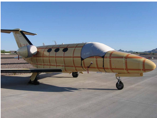
Citation Mustang Light Weight Windshield & Engine Covers

This cover type is made from Silver Acrylic Sunbrella canvas and is 100% lined with a soft and smooth microfiber. Bruce's Custom Covers developed this material combination especially for aircraft protection. The outer material is medium weight and treated for water resistance, UV resistance and anti-static buildup. The inner lining is a very soft and smooth microfiber to prevent scratching. The material is very reflective, and tests show that the cabin interior temperature can be reduced to near-ambient temperature on the hottest of days. It is water, ice and snow repellent, yet breathable to allow moisture to escape from between the cover and the aircraft surface.