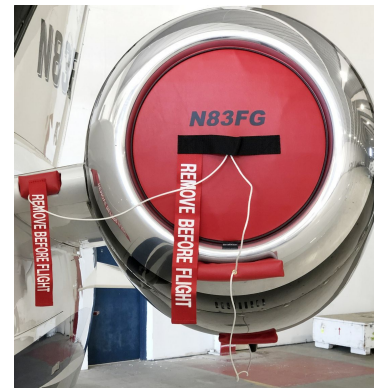
Cessna Citation Mustang 510 Engine Plugs