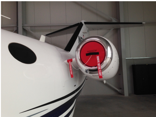
Citation Mustang Engine Intake Plugs

The Engine Inlet Plugs are custom fit for your Cessna Mustang 510 intakes, made with heavy-duty vinyl material, and stuffed with a single block of sculpted urethane foam. Each plug has a zipper that allows the foam to be removed and dried if necessary. Engine plugs have 'remove before flight' streamers sewn onto the face of the plugs. Most plugs are imprinted with the aircraft registration number in black for an extra charge. Storage bag NOT included. Engine plugs may be inserted after flight when the engine is still warm. Engine Inlet Plugs are commonly referred to as Cowl Plugs, Intake Plugs, Cowl Blocks, Engine Blocks, and Engine Bungs.