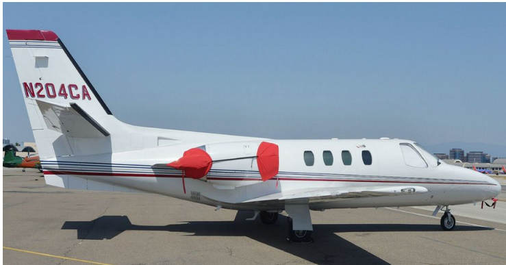
Cessna Citation Engine Covers and Heatshields

The Cessna Citation I (500/501) Intake Covers are designed to install easily yet be completely storable. A spring steel hoop is sewn into the hem of each cover, allowing them to be installed without climbing onto the wing or using a stepladder. To store the covers the spring steel hoop folds like a band-saw blade into three nesting rings. Each cover folds into a compact circular bundle which is stored in the included duffle bag, yet they unfold quickly for use. The Tri-Fold Ring cover is made of medium weight nylon which is available in a variety of colors to match the paint trim. Each cover set comes complete with installation and folding instructions. The aircraft's registration number can be silkscreened onto the cover for an extra charge.