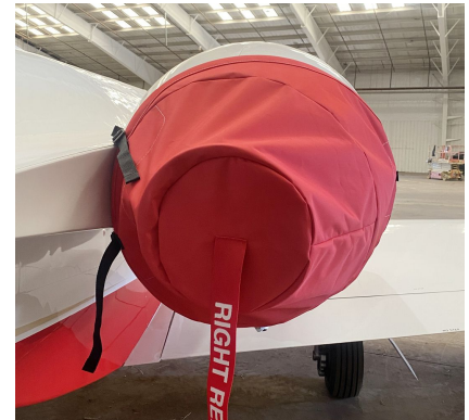
Cessna 501 Engine Covers NO TR's