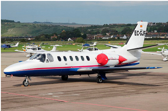
Cessna Citation II Engine Covers, Pitot Covers