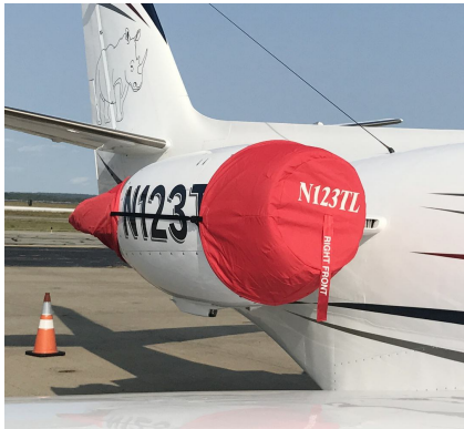
Cessna Citation S/II (S550) Engine Covers (With Tr's)

The Cessna Citation I (500/501) Intake Covers are designed to install easily yet be completely storable. A spring steel hoop is sewn into the hem of each cover, allowing them to be installed without climbing onto the wing or using a stepladder. To store the covers the spring steel hoop folds like a band-saw blade into three nesting rings. Each cover folds into a compact circular bundle which is stored in the included duffle bag, yet they unfold quickly for use. The Tri-Fold Ring cover is made of medium weight nylon which is available in a variety of colors to match the paint trim. Each cover set comes complete with installation and folding instructions. The aircraft's registration number can be silkscreened onto the cover for an extra charge.