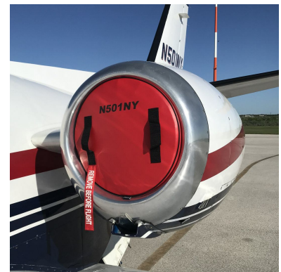
Citation 501 Intake/Exhaust Plug Set