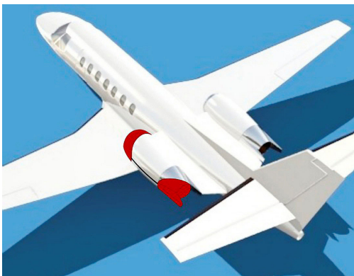
Cessna Citation II with TR's Exhaust Cover Illustration