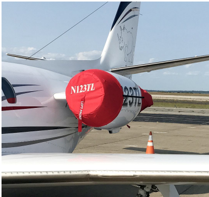
Cessna Citation S/II (S550) Engine Covers (With Tr's)

The Cessna Citation I (500/501) Intake Covers are designed to install easily yet be completely storable. A spring steel hoop is sewn into the hem of each cover, allowing them to be installed without climbing onto the wing or using a stepladder. To store the covers the spring steel hoop folds like a band-saw blade into three nesting rings. Each cover folds into a compact circular bundle which is stored in the included duffle bag, yet they unfold quickly for use. The Tri-Fold Ring cover is made of medium weight nylon which is available in a variety of colors to match the paint trim. Each cover set comes complete with installation and folding instructions. The aircraft's registration number can be silkscreened onto the cover for an extra charge.