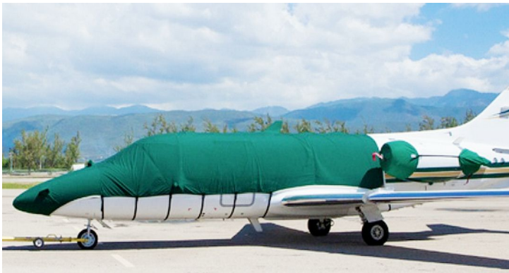
Raytheon Beechjet 400 Fuselage/Nose Cover, Engine Covers

This cover type is made from Silver Acrylic Sunbrella canvas and is 100% lined with a soft and smooth microfiber. Bruce's Custom Covers developed this material combination especially for aircraft protection. The outer material is medium weight and treated for water resistance, UV resistance and anti-static buildup. The inner lining is a very soft and smooth microfiber to prevent scratching. The material is very reflective, and tests show that the cabin interior temperature can be reduced to near-ambient temperature on the hottest of days. It is water, ice and snow repellent, yet breathable to allow moisture to escape from between the cover and the aircraft surface.