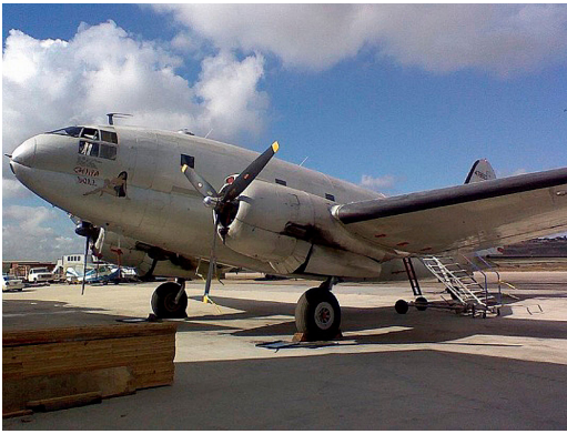
Covers, Plugs and related items for the C-46 Commando