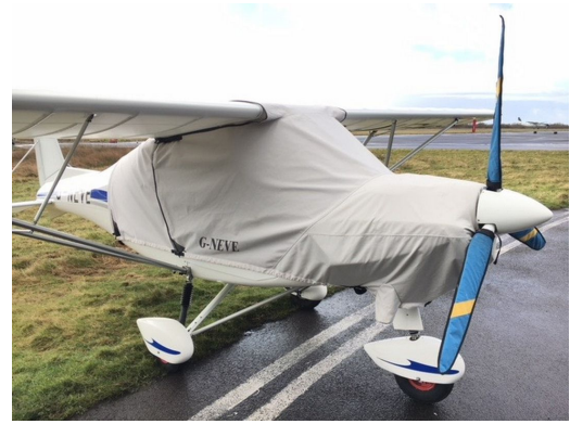
Ikarus C-42 Extended Canopy/Engine Cover