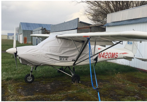
Ikarus C-42 Extended Canopy/Engine Cover