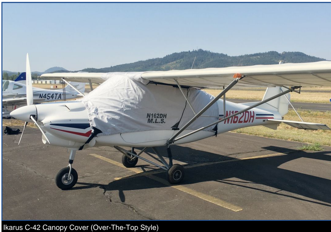
Ikarus C-42 Canopy Cover (Over-The-Top Style)