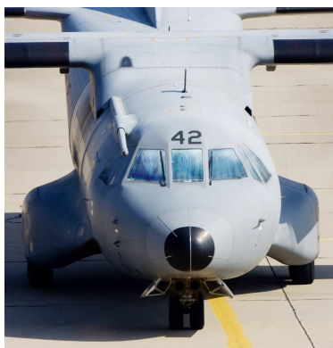
Casa C-295 Cockpit HeatShields (illustration)