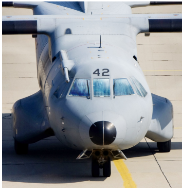
Casa C-295 Cockpit HeatShields (illustration)

This cover type is made from Silver Acrylic Sunbrella canvas and is 100% lined with a soft and smooth microfiber. Bruce's Custom Covers developed this material combination especially for aircraft protection. The outer material is medium weight and treated for water resistance, UV resistance and anti-static buildup. The inner lining is a very soft and smooth microfiber to prevent scratching. The material is very reflective, and tests show that the cabin interior temperature can be reduced to near-ambient temperature on the hottest of days. It is water, ice and snow repellent, yet breathable to allow moisture to escape from between the cover and the aircraft surface.